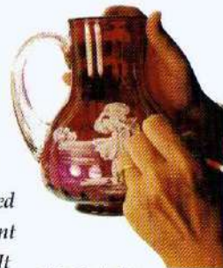
Handpainting on Cranberry in the Mary Gregory style.

Blower, who with his breath, helps shape the red-hot glass. Other Fenton artisans add finishing touches – the famous Fenton crimp, fire polishing, or unique decorative treatments. There may be as many as 28 glassworkers needed to complete one piece! To complement the colorful glass, our decorating designers create handpainted motifs which are fired into the glass for permanent brilliance. Take pride in your new Fenton piece. It reflects the history, excitement and craftsmanship inherent in its creation.