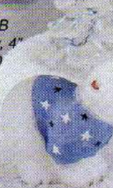
5109 DB Polar Bear, 4 1/2" $32.50