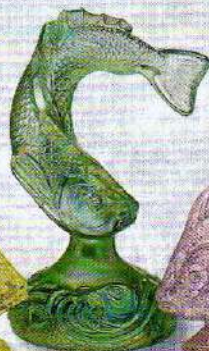
5193 GY Fish Paperweight, 5" $23.50