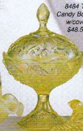
8484 TS Candy Box, 9" w/cover $48.50