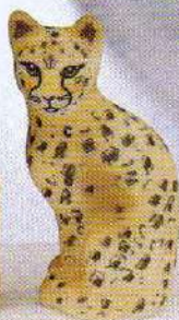
5065 IC Leopard, 5" $45.00