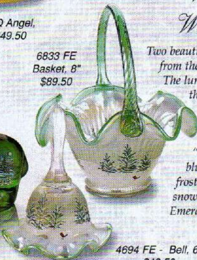
4694 FE - Bell, 6" $49.50