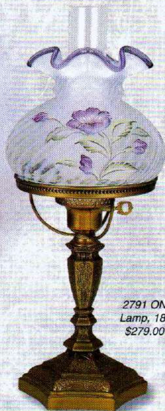
2791 ON Lamp, 18" $279.00

Crisp clear violet - one of today's most popular decorating colors. A wonderful coordinate with pieces from the Lavender Petals collection.