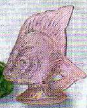
5167 XT Sunfish, 2 1/2" $16.00