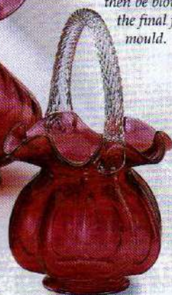
7139 CC Basket, 7 1/2" $75.00