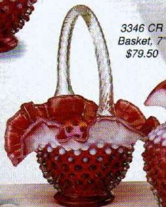
3346 CR Basket, 7" $79.50