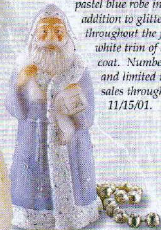
5299 XL Santa, 8" $89.50