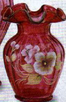
3249 C6 Vase, 5" $59.50

Teamwork is crucial in the creation of cranberry glass... some pieces will be handled by at least 20 skilled craftsmen.