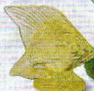
5167 TI Sunfish, 2 1/2" $16.00

Lively, colorful sunfish and "dolphins" are perfect for today's nautical theme. The sunfish was first made in 1930 while our art nouveau style dolphin arrived about 1971.