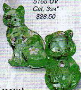
5165 UV Cat, 3 3/4" $28.50

A handler shapes and rounds a basket handle quickly before the handle becomes too cool to move. He has only about 30 seconds to attach and shape the handle.