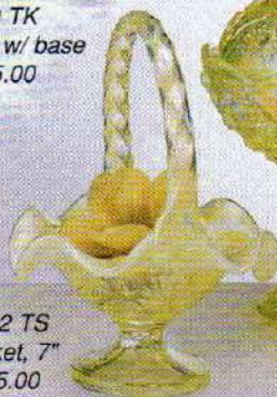
5932 TS Basket, 7" $45.00