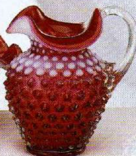
3366 CR Pitcher, 5 1/2" $79.50