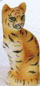
5065 IU Tiger, 5" $45.00