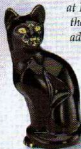
5065 IA Black Panther, 5" $35.00