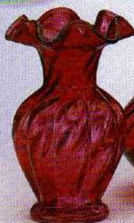
1214 CC Vase, 6" $37.50

Teamwork is crucial in the creation of cranberry glass... some pieces will be handled by at least 20 skilled craftsmen.