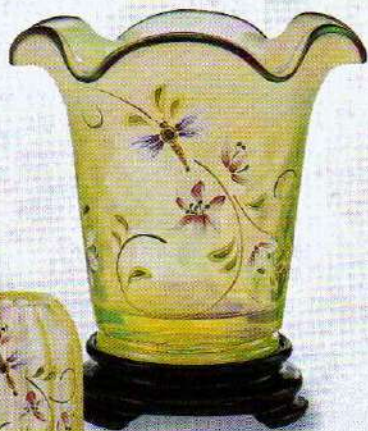
4810 TK Vase, 6", w/ base $105.00