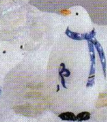
5267 DB Penguin, 4 1/2" $32.50