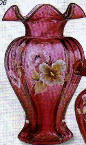
1554 C6 Vase, 9" $129.50

A ribbon of dried leaves and stems peek around the flowers to give this beautiful design a stylized appearance.