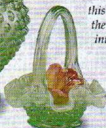
6832 GY Basket, 4 1/2" $27.50