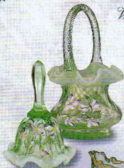
4694 UV Bell, 6 1/2" $39.50