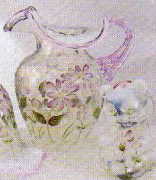
4768 UC Pitcher, 5 1/2" - $89.50