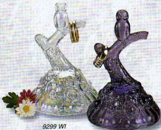
9299 WI $13.50

This embossed rose owl ring tree is available in two pretty Fenton colors through your dealer as a gift with a $45 Fenton purchase. A $13.50 value, it is perfect for a dresser, sink or window sill. Visit and get yours today! (Limit one per customer)