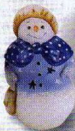
5269 DB Snowlady, 4" $32.50