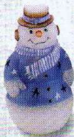
5268 DB Snowman, 4" $32.50

Dressed in decorative sweaters and scarves of soft blues and handpainted stars, Mr. and Mrs. Snowman and their friends get ready for a romp in the snow. Display with glass Christmas trees for fun.