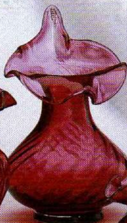
3070 CC Vase, 8 1/2" $69.50