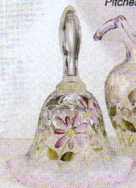
1145 UC Bell, 6 1/2" - $45.00