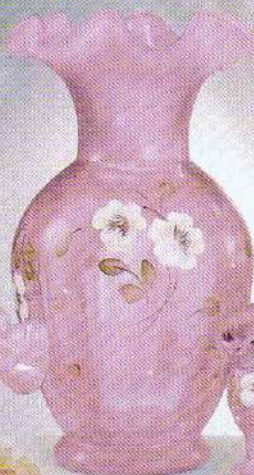
7386 X9 Vase, 9" $89.50