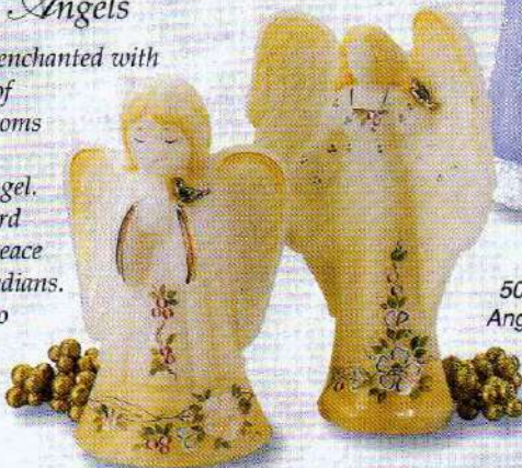
5042 BQ Angel, 6 3/4" $65.00

Angel collectors will be enchanted with Stacy Williams' design of beautiful magnolia blossoms and berries draping the blushed skirts of each angel. A 22k gold plated lovebird adds a further sense of peace to these remarkable guardians. Numbered and limited to sales through 11/15/01.