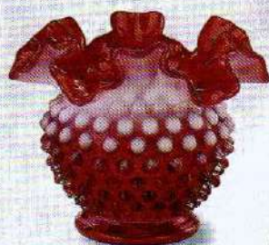
3649 CR Vase, 4 1/2" $52.50