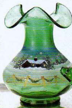
2977 MJ Vase, 7" $79.50

The luminous moon overlooking the "Vermont Sky" is the perfect setting for hot chocolate gatherings in front of a roaring fire. "Woodland Frost" features blustery pines overlooking a frosty background of sparkling snow accented with edges of Emerald Green.