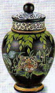
7707 1L Temple Jar, 2 pc. $85.00