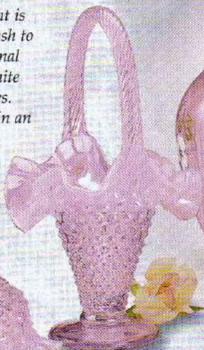
3357 YS Basket, 9" - $49.50