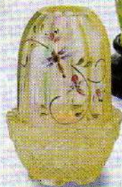
5405 TK Fairy Light, 5" $52.50