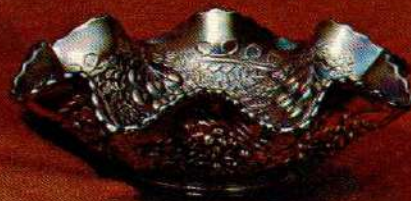
8233 CN Orange Tree & Cherry Bowl, Cr.