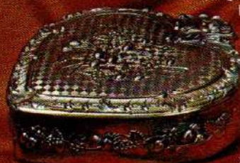
8200 CN Heart Shaped Candy Box