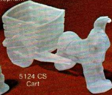
5124 CS Cart