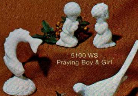
5100 WS Praying Boy & Girl