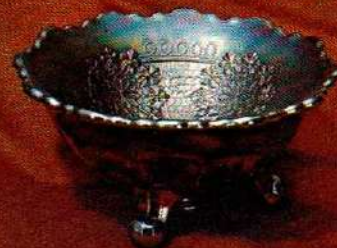
8236 CN Daisy Pinwheels & Cable Bowl