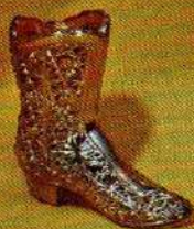
1990 CO Boot