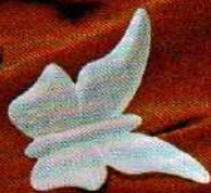
5170 CS Butterfly