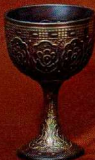
8241 CN Persian Medallion Chalice