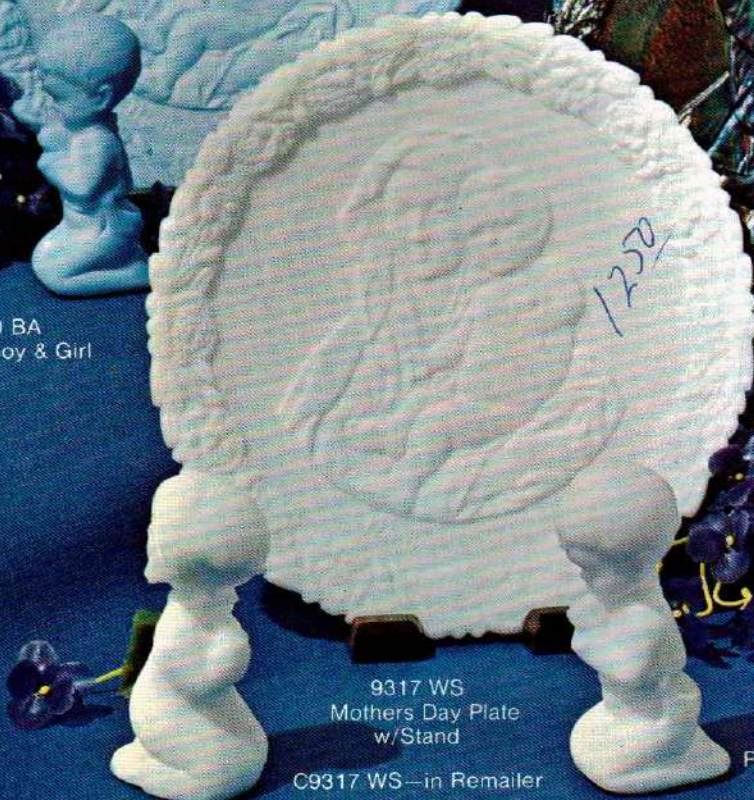
9317 WS Mothers Day Plate w/Stand