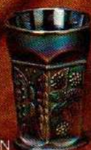
8240 CN Butterfly & Berry Tumbler