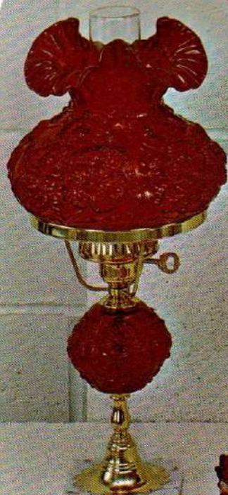
9107 RU 20" Student Lamp