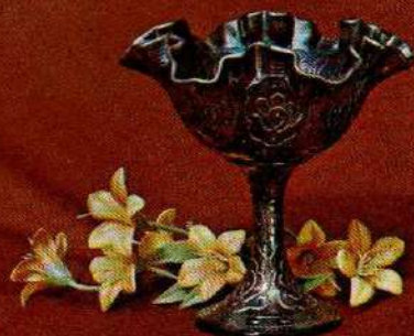
8234 CN Persian Medallion Comport