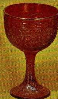
8241 CO Persian Medallion Chalice