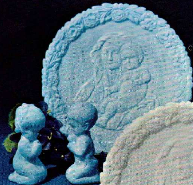
5100 BA Praying Boy & Girl