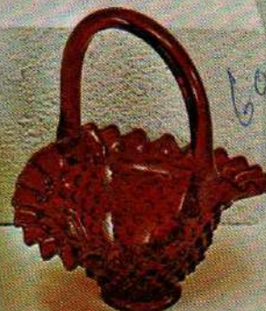
3837 RU 7" Basket