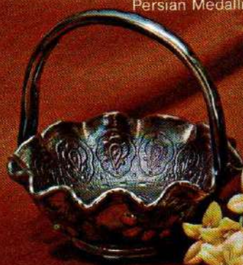
8238 CN Persian Medallion Basket