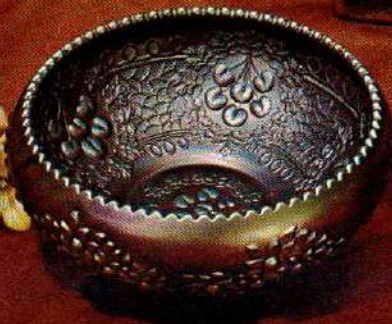
8232 CN Orange Tree & Cherry Bowl, Cupd.