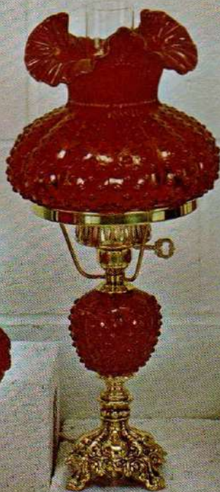
3807 RU 21" Student Lamp