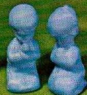
5100 BA Praying Boy & Girl