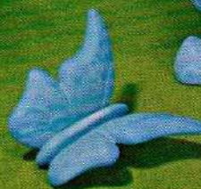
5170 BA Butterfly