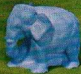
5123 BA Elephant