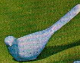
5197 BA Bird