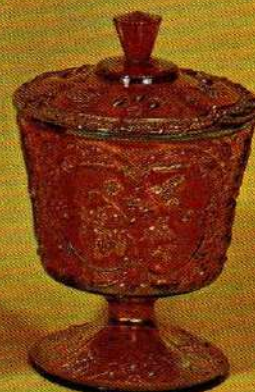
9088 CO Wild Strawberry Candy Box