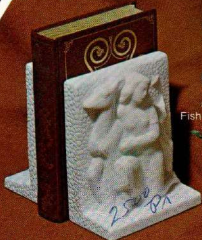
5102 WS Girl & Fawn Book Ends