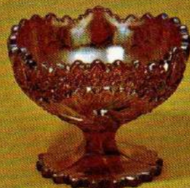
8227 CO Pinwheel Comport