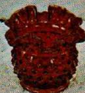
3853 RU 3" Vase