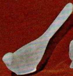
5197 CS Bird