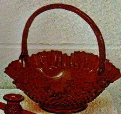
3734 RU 12" Basket