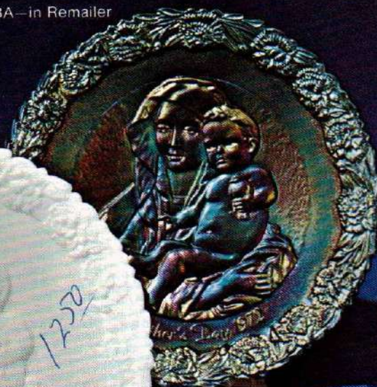
9317 CN Mothers Day Plate w/Stand