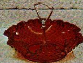
3706 RU Handled Bonbon