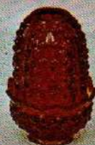
3608 RU Fairy Light w/Candle