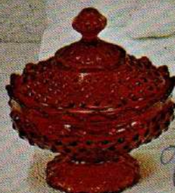
3886 RU Candy Box