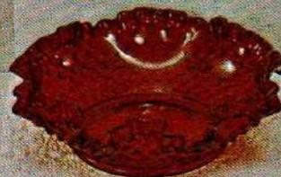
3716 RU 8" Bonbon