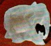
5123 CS Elephant