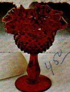
3628 RU Ftd. Comport