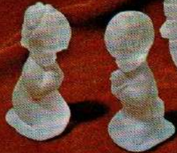
5100 CS Praying Boy & Girl