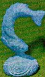
5193 BA Fish Paperweight