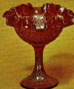
8234 CO Persian Medallion Comport