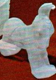
5125 CS Donkey