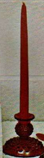
3974 RU Candleholder