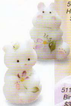
5063 DC Hippo, 3" $32.50