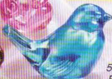
5163 KJ Bird, 4" $19.50