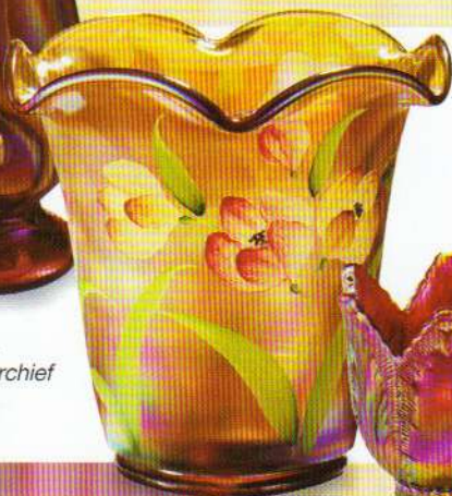
2753 RL Vase, Handkerchief 10" $99.50