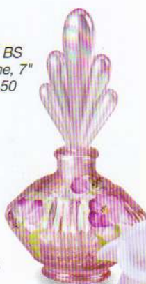
7107 BS Perfume, 7" $69.50