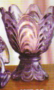
2077 OE Votive, Drapery, 4" $23.50