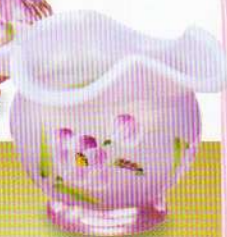
7739 BS Rose Bowl, 3½" $49.50