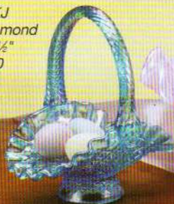
8535 KJ Basket, Diamond Lace, 5½" $39.50