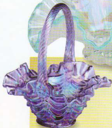
4230 YV Basket, Paneled, 10" (French Opalescent w/Violet) $99.50

Classic shapes handcrafted by Fenton artisans for your spring decorating and entertaining. Each sparkling basket is offered in a variety of candy confection colors perfect to give or to own.