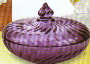
4280 OE Candy Box, 6 1/2" $49.50