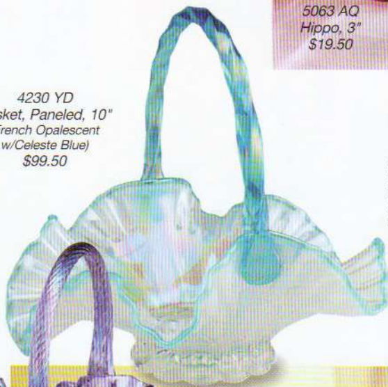
4230 YD Basket, Paneled, 10" (French Opalescent w/Celeste Blue) $99.50