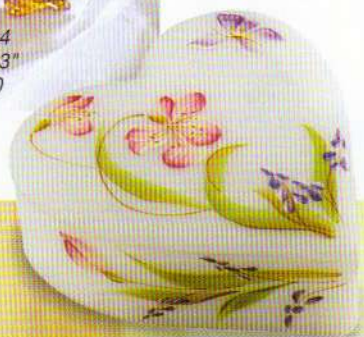
4202 UW Heart Box, 6¼" w. Inscribed with the signatures of ten Fenton family members and ALSA Logo $95.00