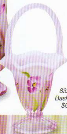
8329 BS Basket, 7½" $69.50