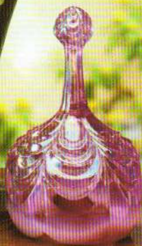
6536 NI Bell, 6" $34.50