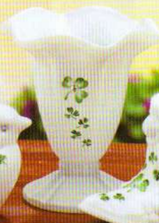
4258 JB Vase, Footed, 4¼" $39.50