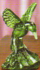
5066 ZL Hummingbird, 4½" $19.50