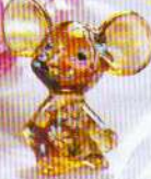
5148 D4 Mouse, 3" $29.50