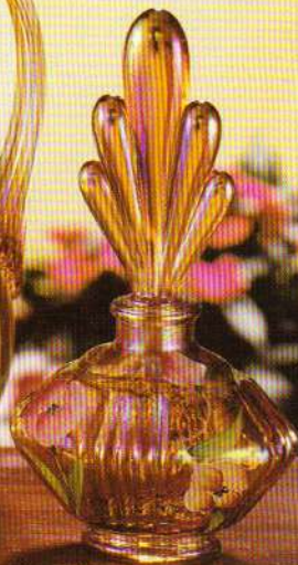
7107 A9 Perfume, 7" $69.50