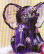
5058 D1 Elephant, 3½" $32.50