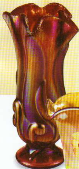
4751 A9 Vase, 7½" $89.50

Home décor's most popular color combination—red and gold—is showcased in this plush collection inspired by the designs and colors of Tuscany. Kim Barley's elegant floral design "Tuscan Charm" glows with life.