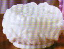
6390 NG Shellflower, 3" $39.50