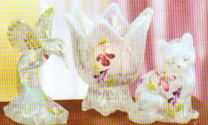
9578 WB Votive, 4 1/4" $35.00