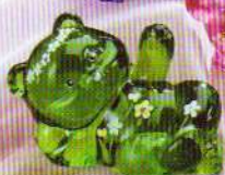
5233 DY Bear, Reclining, 3½" $32.50