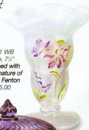
8951 WB Vase, 7 1/2" Inscribed with the signature of Nancy Fenton $95.00