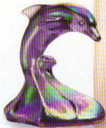
5087 OQ Dolphin, 4" $19.50

A delightful assortment of figurines representing land, air and sea. The Hippo and Dolphin are new Fenton moulds from Jon Saffell. Perfect pieces to introduce a young collector to Fenton glass.