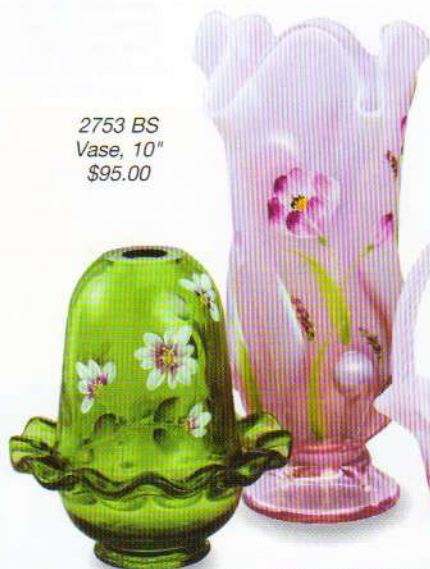
2753 BS Vase, 10" $95.00