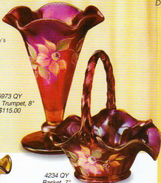
4234 QY Basket, 7" $95.00