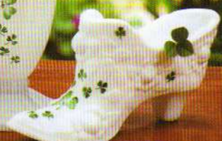
9295 JB Slipper, Rose, 6" $24.50