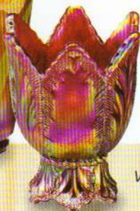
9596 UR Votive, 2-way, 4½" $29.50