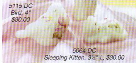
5064 DC Sleeping Kitten, 3½" L. $30.00