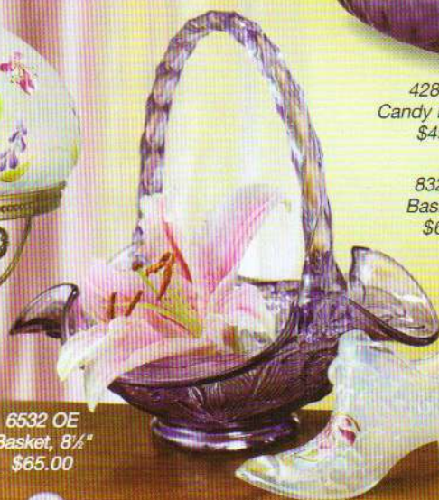
9295 WB Slipper, 6" I. $24.50