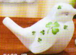
5163 JB Bird, 4" $29.50

The luck of the Irish will follow you with five new items in fresh Milk Glass. Precious Swarovski crystals sparkle on Robin Spindler's shamrock design.