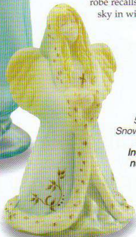
5053 JU Snow Angel, 7 3/4" $79.50 Individually numbered

A brand new sculpture from Suzi Whitaker, our Snow Angel will become a family heirloom to be displayed with pride. Her fur-trimmed robe recalls the hue of blue sky in winter.