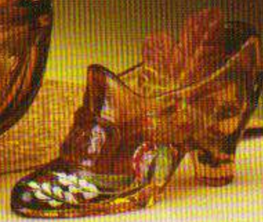
7737 QM Shoe, 4½" l. $29.50