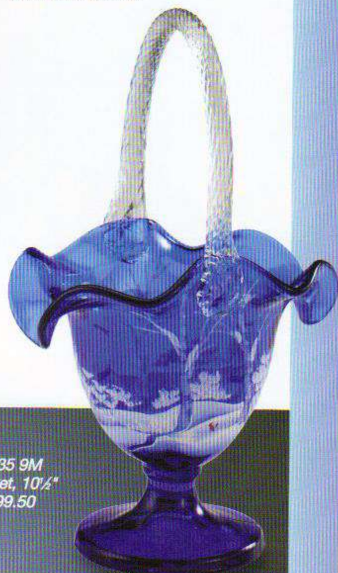
6335 9M Basket, 10½" $99.50