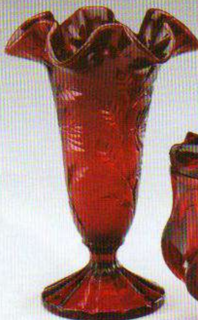
7689 RU Vase, Cut Tulip, 8" $42.50