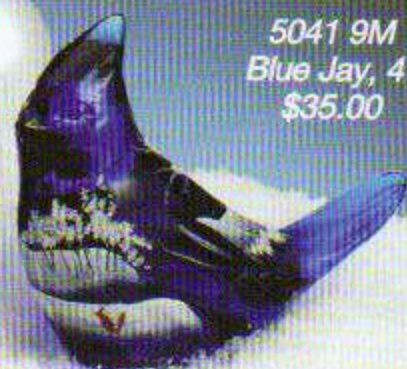
5041 9M Blue Jay, 4" $35.00