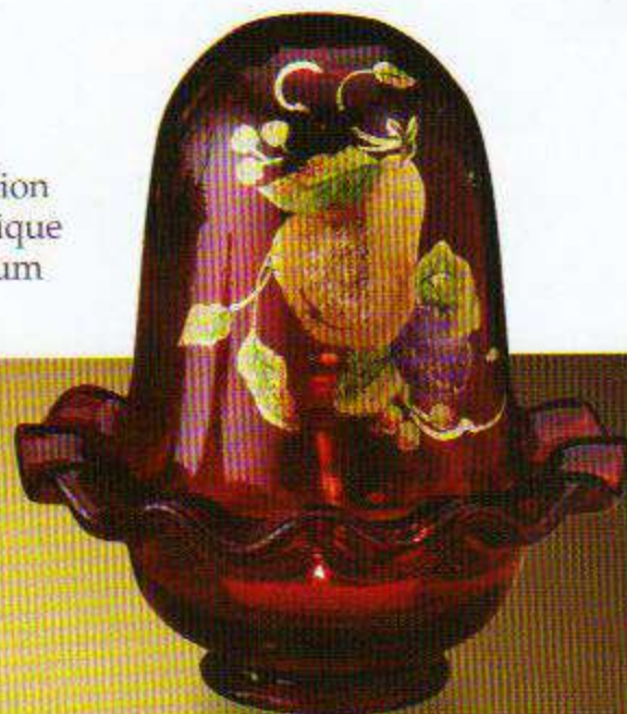
5980 3V Fairy Light, 5½" $99.00