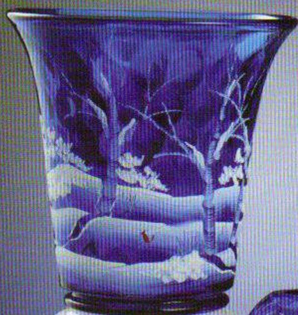
4861 9M Vase, 7½" $99.50

The picturesque Canaan Valley of West Virginia is celebrated once again for Christmas 2006. Ice-covered trees and frosty woodlands come to life in this popular handpainted motif designed by Robin Spindler. Each Canaan Valley article features the West Virginia state bird, a bright red male Cardinal, within the design.