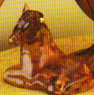
5057 AM Horse, 4", $25.00