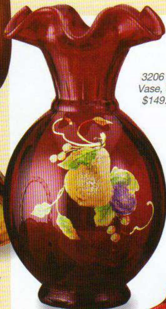
3206 3V Vase, 9¼" $149.00