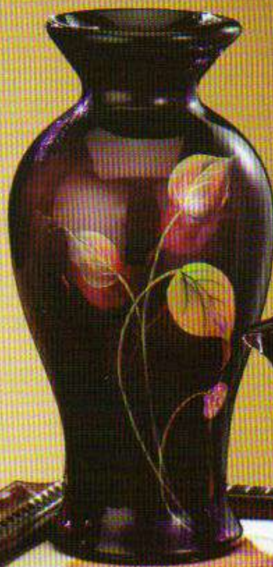
5469 JN Vase, 7½" $65.00

Deep rich Aubergine strikes an elegant note. This warm color was inspired by fashion and then quickly embraced by home decorators. Stacy Williams created a design that captures attention with complex shading. Layer upon layer of sheer color flows fluidly through breeze-touched leaves accented by a pink Kousa pod.