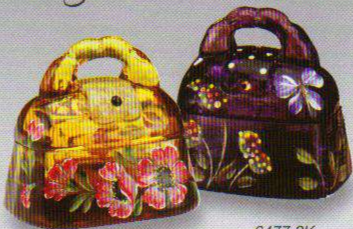
6477 9A Purse, 3" $49.50