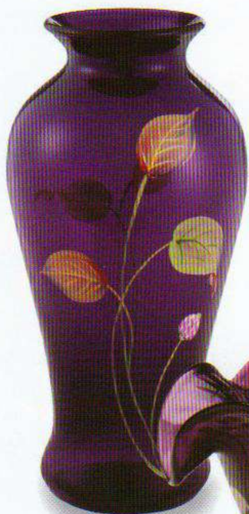
2955 JN Vase, 9" $95.00