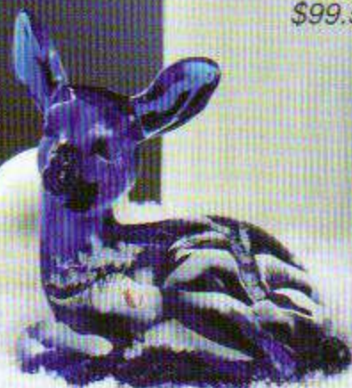
5160 9M Fawn, 3¾" $39.50

The picturesque Canaan Valley of West Virginia is celebrated once again for Christmas 2006. Ice-covered trees and frosty woodlands come to life in this popular handpainted motif designed by Robin Spindler. Each Canaan Valley article features the West Virginia state bird, a bright red male Cardinal, within the design.