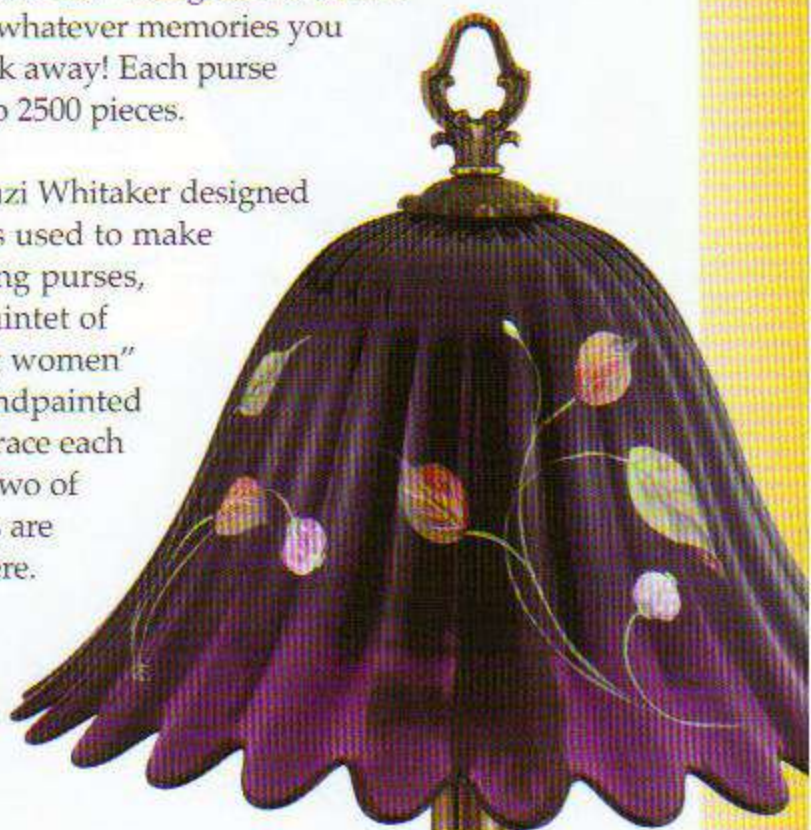
4244 JN Lamp, Petal, 19" $279.50

Sculptor Suzi Whitaker designed the moulds used to make these darling purses, and our quintet of "designing women" created handpainted motifs to grace each selection. Two of the designs are featured here.