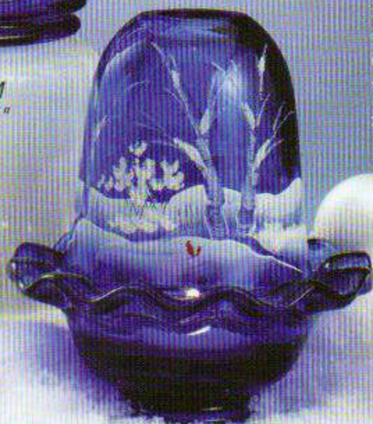
5980 9M Fairy Light, 5½" $77.50