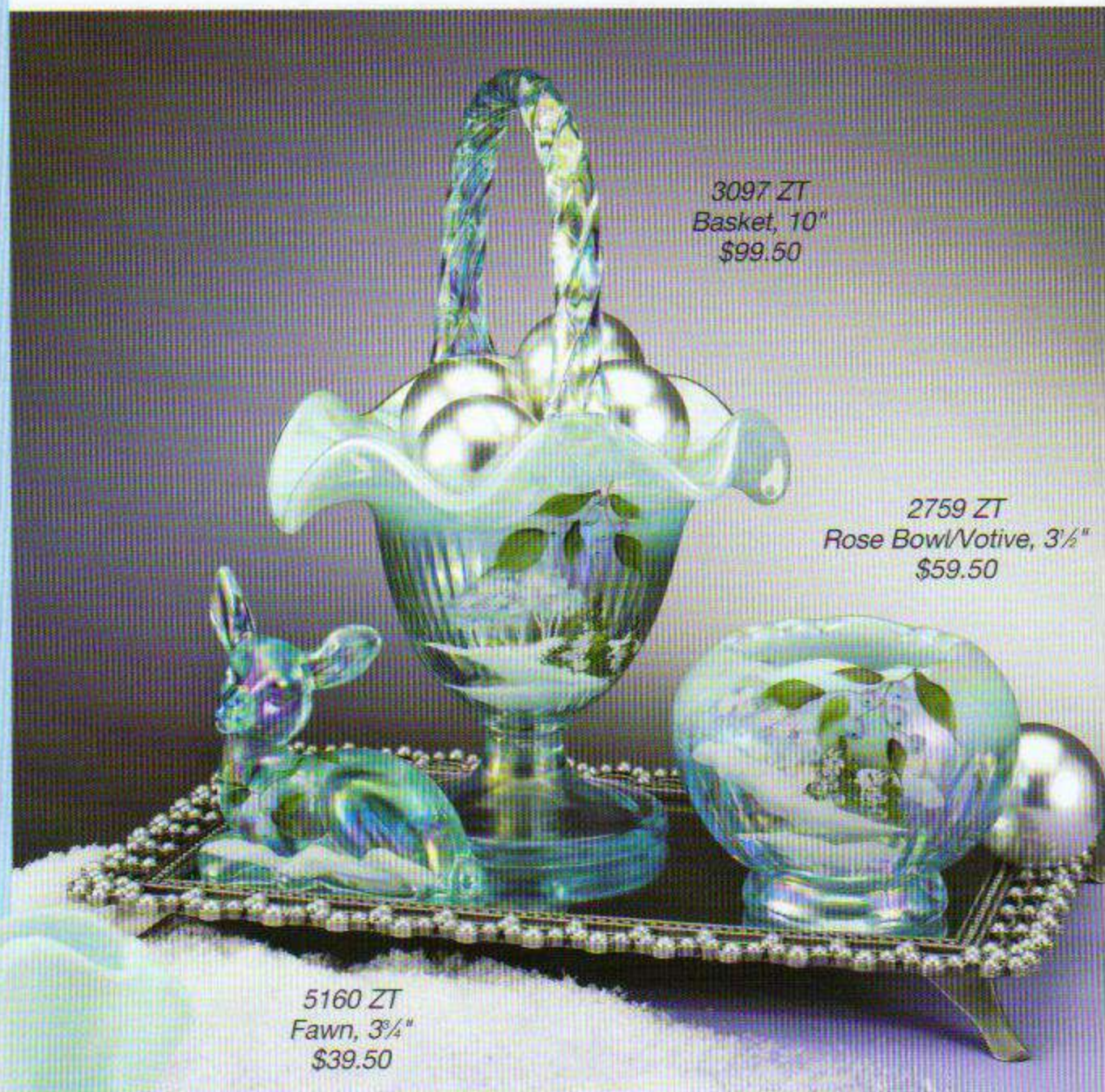
3097 ZT Basket, 10" $99.50

Handpainted by skilled Fenton artists, Winter Wonderland will capture your imagination. The raised crystal ice used in this breathtaking scene creates sparkling texture and remarkable depth. The Aquamarine Opalescent glass has been sprayed with metallic salts for a shimmering iridescent background. The covered Candy Box is a new design by sculptor Suzi Whitaker.