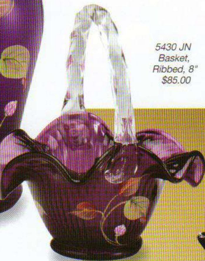
5430 JN Basket, Ribbed, 8" $85.00