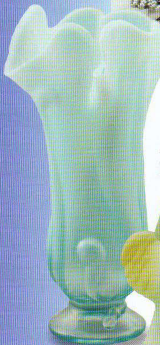
2753 9N Vase, Handkerchief 10" $85.00