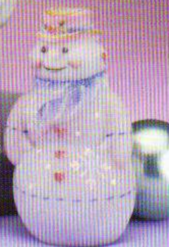
5268 NL Snowman, 4" "Ralph" $49.50