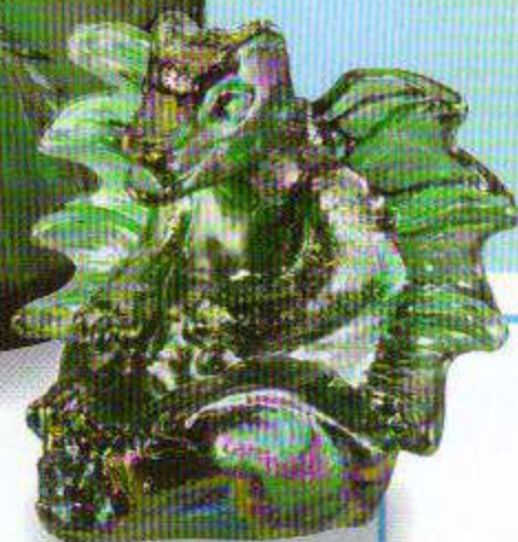
7104 EY Candy Box/ Candle Jar, 7½" $55.00 (Lynn Fenton)