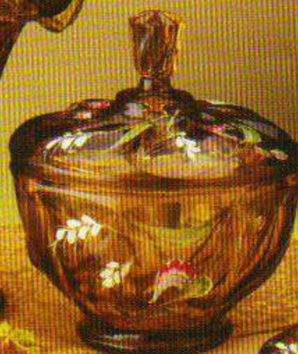
7087 QM Box, Prism, 5½" $69.50