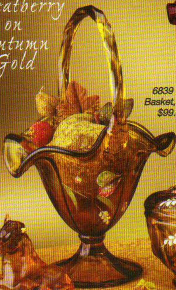
6839 QM Basket, 10½" $99.50