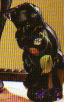
5074 JN Cat, Grooming, 4" $29.50