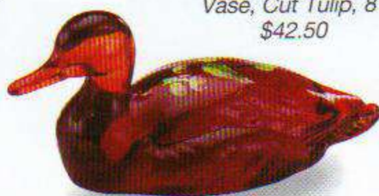
5147 3V Mallard, 5" $39.50