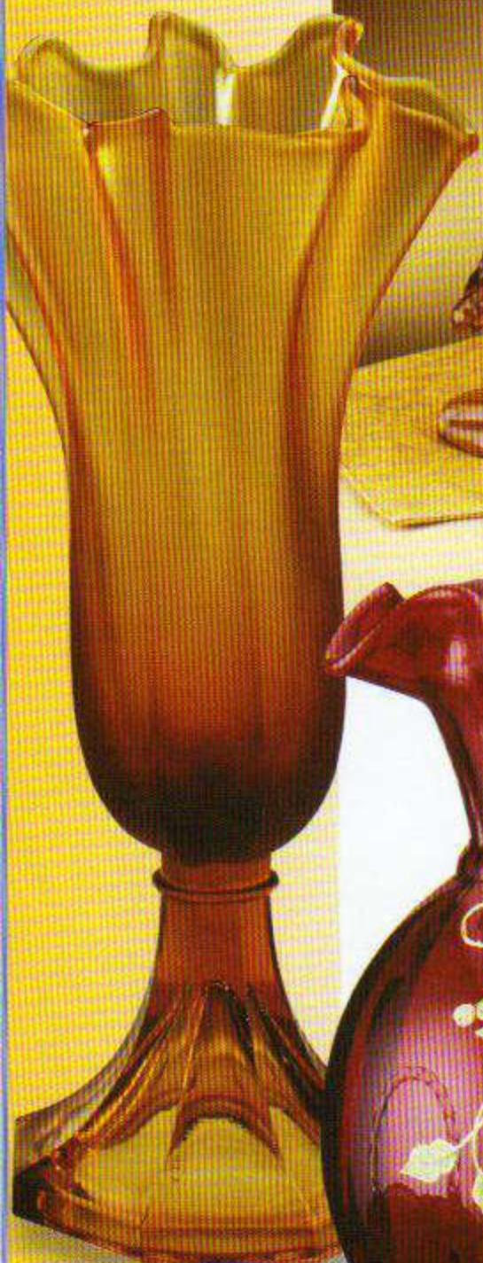
4353 A1 Vase, Swung 11"-13" $95.00