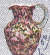
6464 RG Cream Pitcher