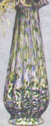
6459 GB 14" Vase