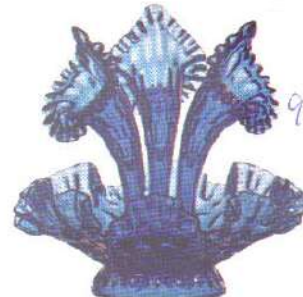
4401 CB 4 pc. Epergne Set