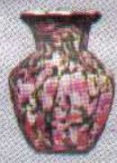
6455 RG 5 1/2" Vase