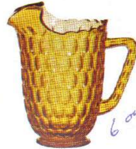
4464 CA 2 qt. Ice Lip Jug