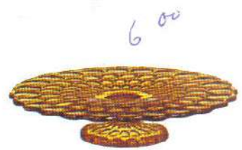
4411 CA Ftd. Cakeplate