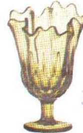
4454 CG 8" Ftd. Vase