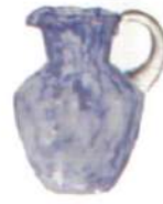
6464 BM Cream Pitcher