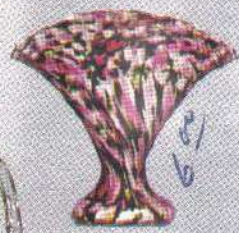
6457 RG 7" Fan Vase