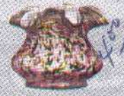
6454 RG 4" Vase