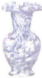
6456 BM 8" Vase