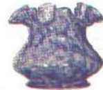
6454 BM 4" Vase