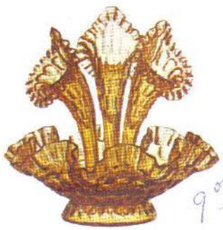
4401 CA 4 pc. Epergne Set