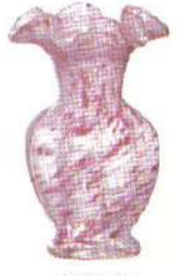
6456 RM 8" Vase