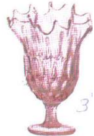
4454 CP 8" Ftd. Vase