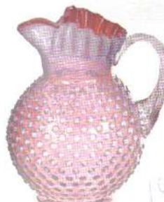
3664 CR 70 oz. Ice Lip Jug