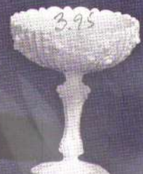
9222 MI Rose Comport