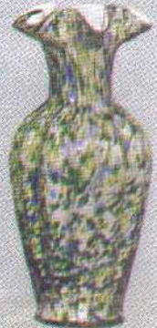
6458 GB 11" Vase