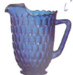
4464 CB 2 qt. Ice Lip Jug