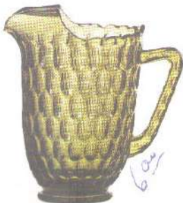
4464 CG 2 qt. Ice Lip Jug