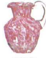
6464 RM Cream Pitcher