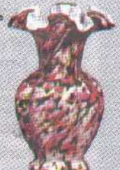
6456 RG 8" Vase

Vasa Murrhina glass was first honored in Roman palaces nearly 2000 years ago. In the nineteenth century it became one of the most desired examples of historically famous Sandwich glass. Now—Fenton brings you Vasa Murrhina—in pleasing Early American designs. Its unusual richness and enchanting color patterns will appeal to all who prize the unique in beauty.