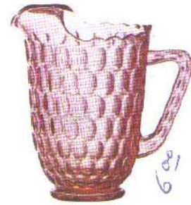
4464 CP 2 qt. Ice Lip Jug