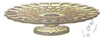
4411 CG Fid. Cakeplate