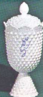
3689 MI Apothecary Jar