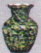
6455 GB 5 1/2" Vase