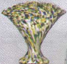
6457 GB 7" Fan Vase