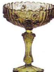
9222 CG Rose Comport