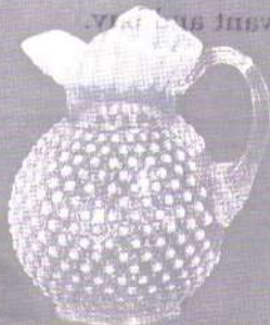
3664 FO 70 oz. Ice Lip Jug