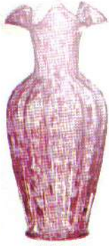
6458 RM 11" Vase