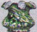
6454 GB 4" Vase