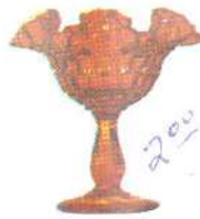
4429 OR Ftd. Comport