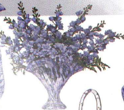
6457 BM 7" Fan Vase