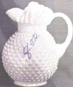
3664 MI 70 oz. Ice Lip Jug