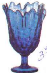
4454 CB 8" Ftd. Vase