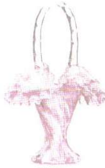
6437 RM Hdl. Basket 11" High