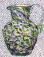
6464 GB Cream Pitcher