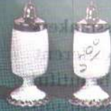
7406 SC Salt & Pepper Set

At last we have a salt and pepper set worthy of the name Silver Crest. It has the luxury expected in handmade glass by Fenton—and only Fenton has Silver Crest Pelliccoat glass.