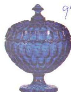
4488 CB Royal Wedding Bowl