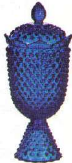
3689 CB Apothecary Jar