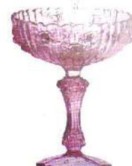
9222 CP Rose Comport