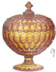
4488 CA Royal Wedding Bowl