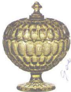
4488 CG Royal Wedding Bowl