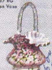
6435 RG Hdl. Basket 7" High