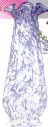
6459 BM 14" Vase