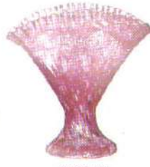
6457 RM 7" Fan Vase