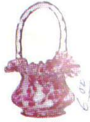
6435 RM Hdl. Basket 7" High