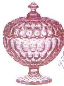
4488 CP Royal Wedding Bowl