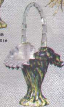
6437 GB Hdl. Basket 11" High