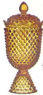
3689 CA Apothecary Jar