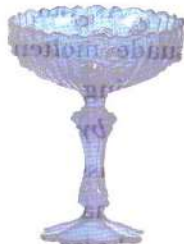
9222 CB Rose Comport