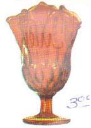
4454 OR 8" Ftd. Vase