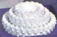
3610 MI 3 pc. Ash Tray Set Gift Boxed

The perfect gift to suggest for home or office.