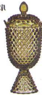
3689 CG Apothecary Jar