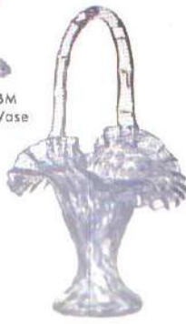
6437 BM Hdl. Basket 11" High