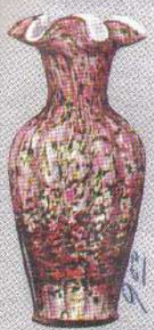
6458 RG 11" Vase