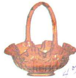
4438 OR 8 1/2" Basket