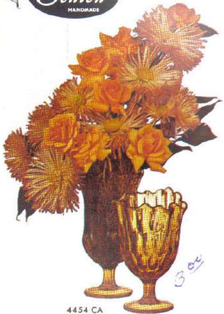
4454 CA 8" Ftd. Vase