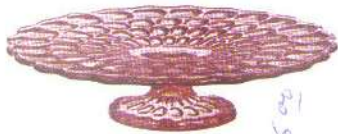
4411 CP Fid. Cakeplate