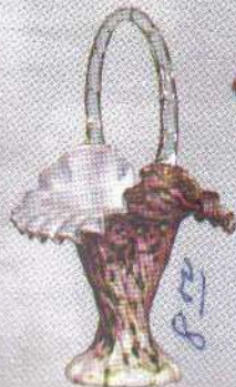
6437 RG Hdl. Basket 11" High