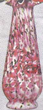
6459 RG 14" Vase