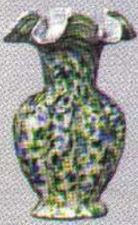
6456 GB 8" Vase