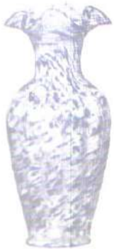
6458 BM 11" Vase