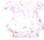
6454 RM 4" Vase