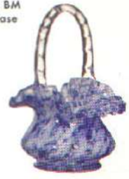
6435 BM Hdl. Basket 7" High