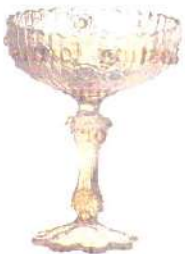
9222 CA Rose Comport