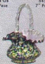
6435 GB Hdl. Basket 7" High