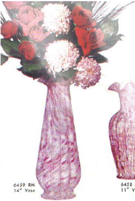
6459 RM 14" Vase