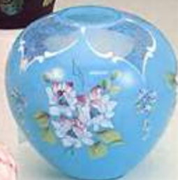
C. 8805 X3 Vase, "Victorian Roses" (950)