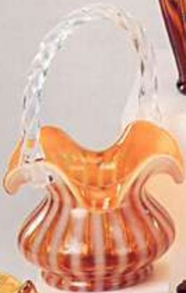
1531 AO Basket Fine Rib, 8" (*)