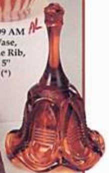
8369 AM Bell, Barred oval, 6" (*)