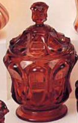
8388 AM Candy w/cover, Barred oval (*)