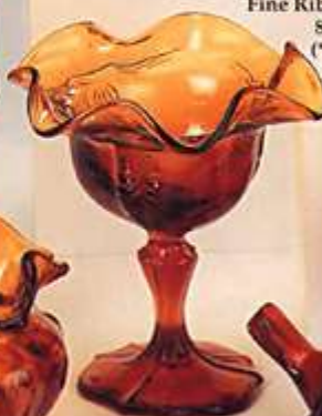
9229 AM Comport, 6 1/2" (* )