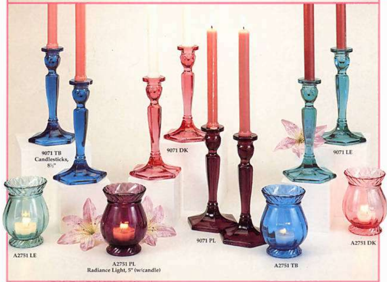
9071 TB Candlesticks, 8 1/2"