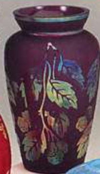
D. 7661 P4 Vase, 9", "Leaves of Gold" (950)