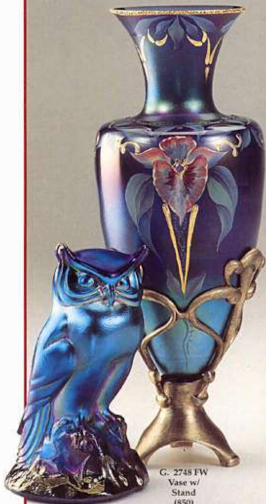
G. 2748 FW Vase w/ Stand (850) 2/store