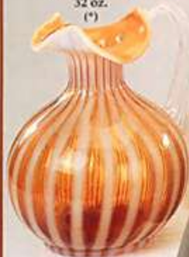
1569 AO Pitcher, Fine Rib, 32 oz. (* )