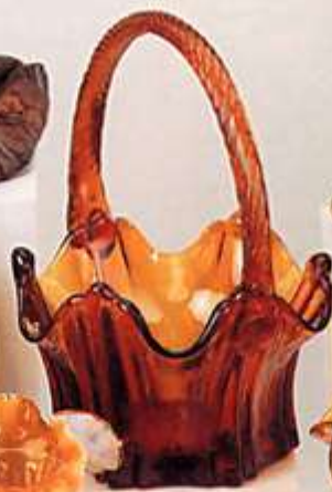
9544 AM Basket, Vulcan, 8" (* )