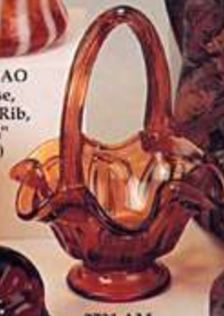
2731 AM Basket, 6" (*)