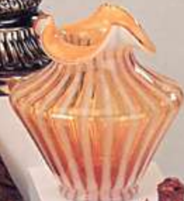
1599 AM Vase, Fine Rib, 5" (*)