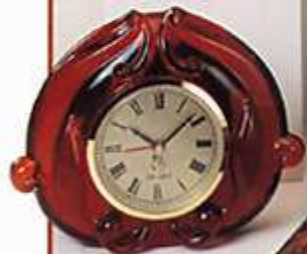
8691 AM Clock, 4 1/2"