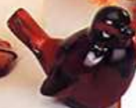
5163 AM Bird, 4" (* )