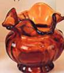
7620 AM Vase, 3 1/2" (* )