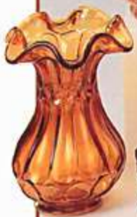
9050 AM Vase, 5 1/2" (*)