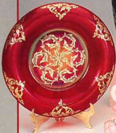
A. 2747 RX Bowl, Rolled Rim (1250)