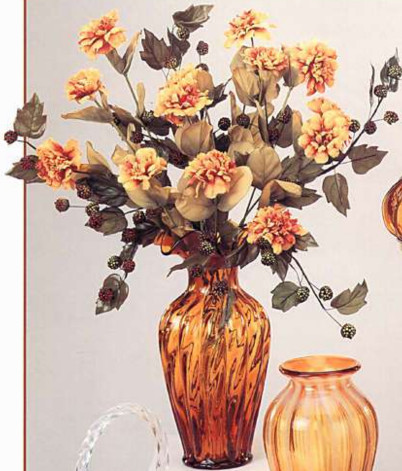
3161 AM Vase, 11"

Handmade in the USA in the age old manner.