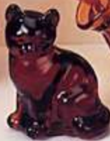
5165 AM Cat, 3 1/2" (*)