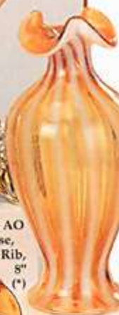
1558 AO Vase, Fine Rib, 8" (* )