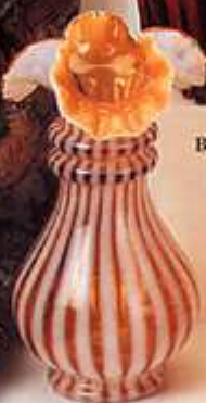
1549 AO Vase, Fine Rib, 7"