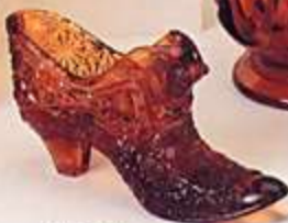
1995 AM Slipper, Daisy & Button (**)