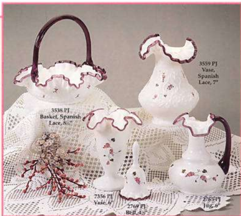
3538 PJ Basket, Spanish Lace, 8 1/2"

Includes 2 each of 4 Radiance Lights and 1 each of 4 pairs of candlesticks.