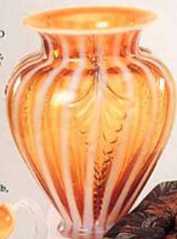
1218 AO Vase, Feather, Rib, 8" (* )