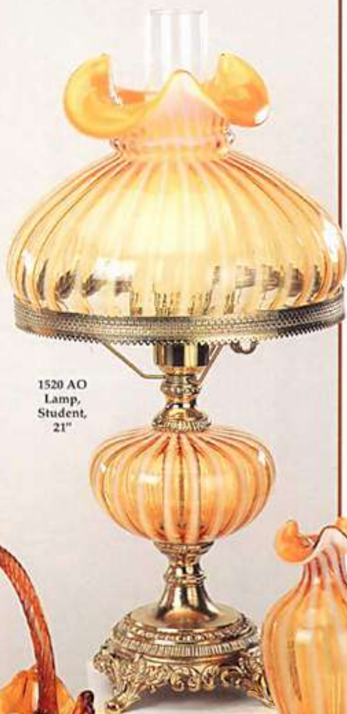
1520 AO Lamp, Student, 21"

(Refer to * items for assortment make-up.)