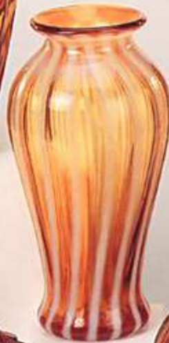
1559 AO Vase, Fine Rib, 9 1/2" (*)