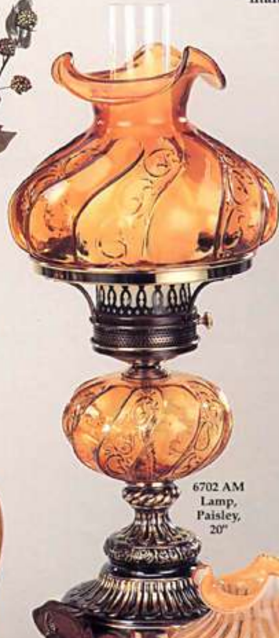
6702 AM Lamp, Paisley, 20"