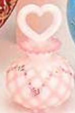
B. 1710 R5 Perfume w/stopper, (1250) "Rose Trellis"