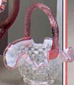
1159 IH Basket, 6"