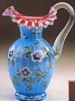
2796 ZM 9 1/2" Pitcher, Limit 490, Retail $250

piece will shatter. A crystal ring and handle are deftly applied to the blown pitcher before it is iridized. Martha Reynolds' lilted floral drifts over the surface to complete the piece.