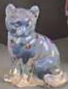
5165 DX Cat, 3 3/4"