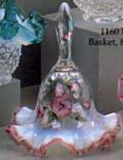
1145 DX Bell, 6 1/2"