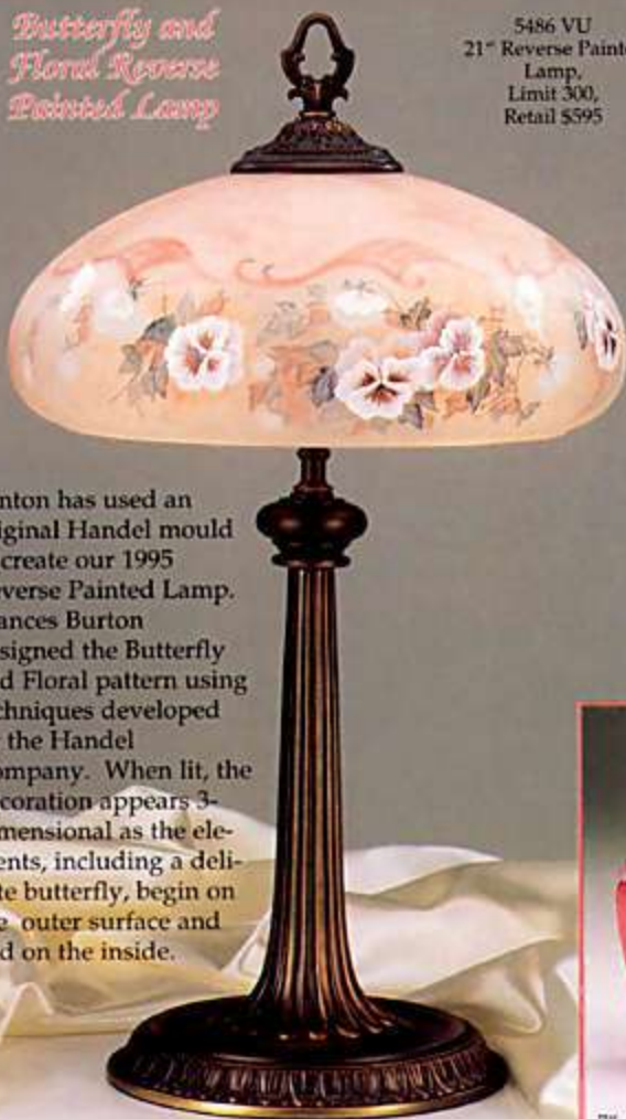
5486 VU 21" Reverse Painted Lamp, Limit 300, Retail $595