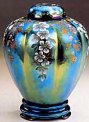
2950 VN 8 1/2" 3 Pc. Ginger Jar, Limit 790, Retail $275

Favrene Ginger Jar Martha Reynolds designed a matte enamel floral to contrast with the metallic shimmer of Favrene in this 3-piece Ginger Jar. Pure silver in the molten glass is coaxed to the surface when the piece is reheated after being blown. The gas and oxygen mix, temperature and timing must be perfectly balanced to achieve the rich silvery finish. The color was originated by L.C. Tiffany as Blue Favrile.