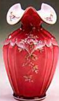
7691 WF 7" Aurora Vase, Limit 890, Retail $125.