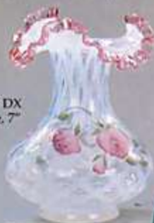
1129 DX Vase, 7"