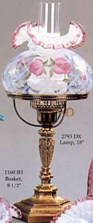
2793 DX Lamp, 18"