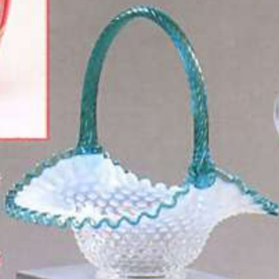
3830 IM Basket, 10 1/2"

Refer to order blank for assortment make-up.