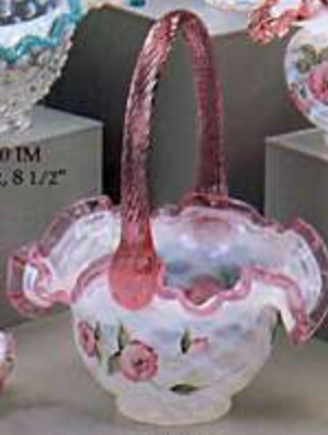
1144 DX Basket, Lily, 8"