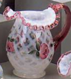
1132 DX Pitcher, 7"