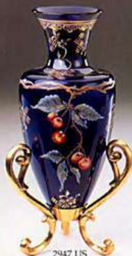
2947 US 10 1/4" Amphora w/ Stand, Limit 890, Retail $195

Martha Reynolds used gleaming cherries highlighted with gold and ivory to complement the polished brass stand and deep purple color.