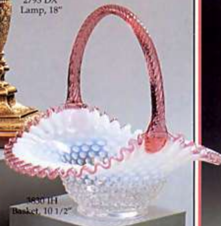
3830 IH Basket, 10 1/2"