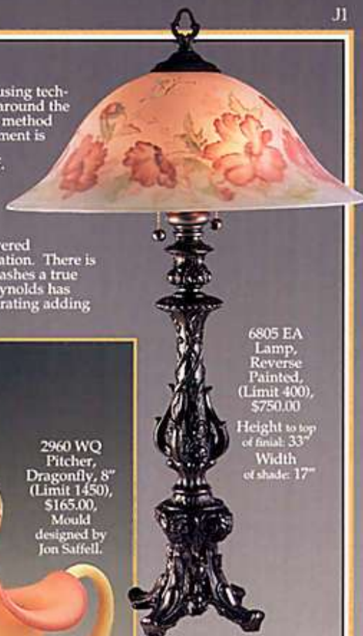
6805 EA Lamp, Reverse Painted, (Limit 400), $750.00

Frances Burton designed the Poppies lamp using techniques developed by the Handel Company around the turn of the century. The authenticity of this method can be seen inside the shade where each element is painted and fired resulting in sharp, clear permanent colors that cannot be chipped off. A classic work of art.