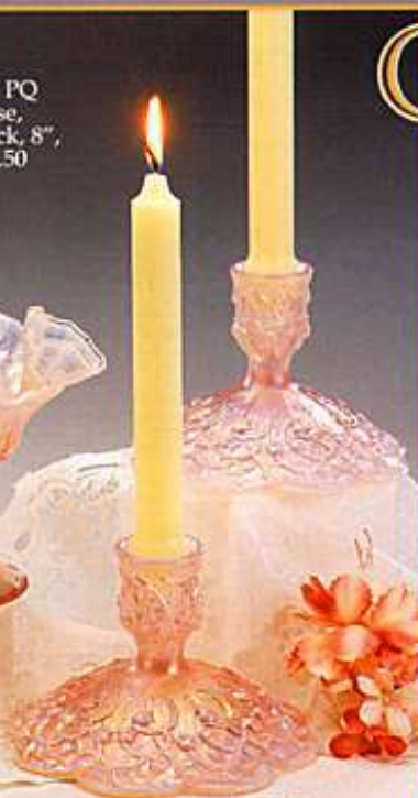
8475 PQ Candleholders, 4", $39.50