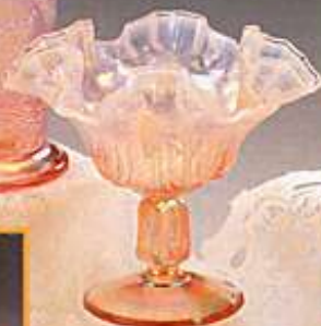
3429 PQ Comport, Cactus, 5 1/2", $25.00