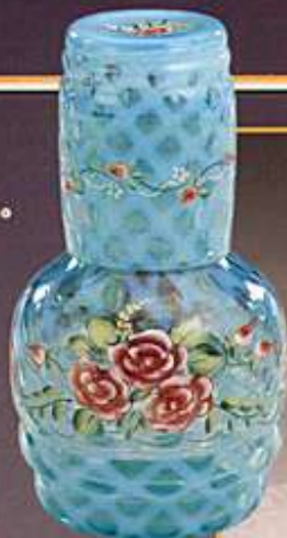
1180 TE Tumble-up Set, 2 Pc., 6" $99.50

After receiving many requests for new guest sets and tumble ups, Fenton recreated the deco-styled set. It will be available in Blush Rose along with the bell, basket and Cactus patterned cruet for the remainder of 1996.