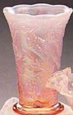
8257 PQ Vase, Peacock, 8", $32.50