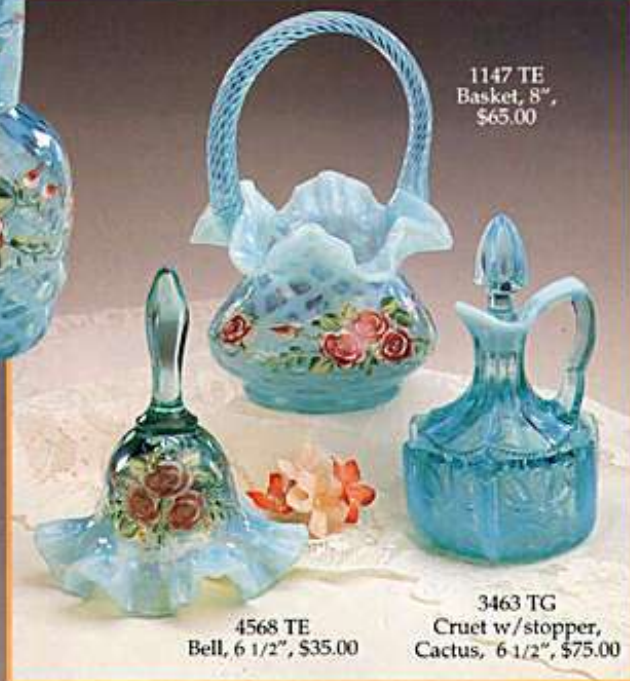
1147 TE Basket, 8", $65.00

Guest sets were popular in the 1920's for keeping fresh water at bedside. Fenton produced three styles including this one with its distinctive art deco bands. The sets were also called night sets because of their bedtime use or "tumble-ups" because the upside down tumblers kept flies out of the water.