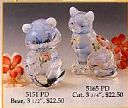
5151 PD Bear, 3 1/2", $22.50

REFER TO PAGES 8 & 9 OF THE GENERAL CATALOG FOR ADDITIONAL CHAMPAGNE SATIN AND MEADOW BEAUTY PIECES