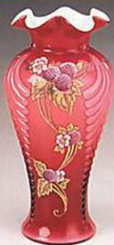
2782 DD Vase, Berries, 11" (Limit 1250), $195.00