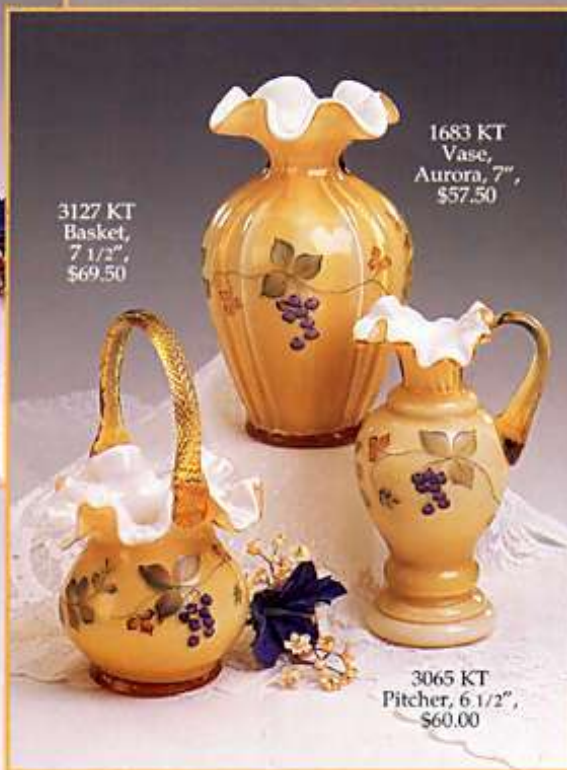
1683 KT Vase, Aurora, 7", $57.50