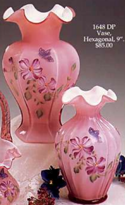
1648 DP Vase, Hexagonal, 9", $85.00