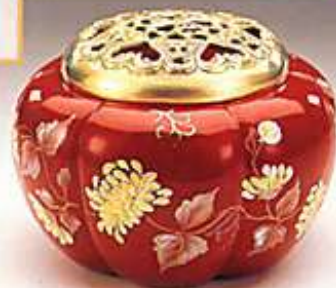
6584 CD, Box w/lid, Mandarin, 7"w. (Limit 1250), $150.00, Mould originated at the Handel company and was purchased in 1991.