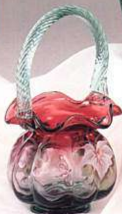
7139 BW Basket, Melon, 7 1/2" (Limit 1750) $99.00