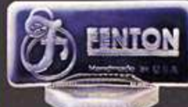
9799 FO Logo, 5" w., $25.00