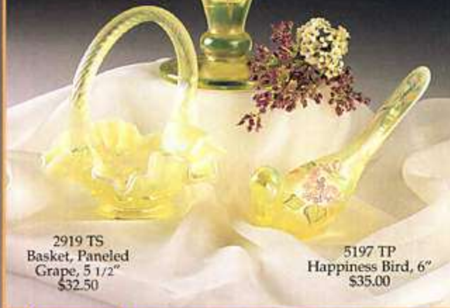
2919 TS Basket, Paneled Grape, 5 1/2" $32.50