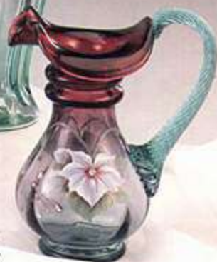
3066 BW Pitcher, 6" (Limit 1750) $95.00