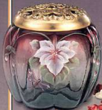
1581 BW Box, Melon, 5 1/4" (Limit 1750) $135.00