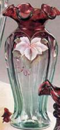
7565 BW Vase, Reverse Melon, 8" (Limit 1750) $95.00