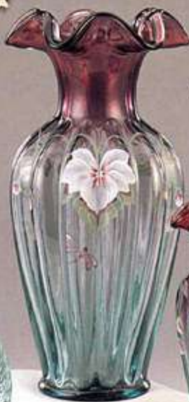
7458 BW Vase, Melon, 11" (Limit 1750) $135.00