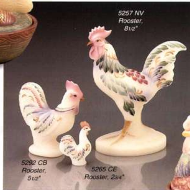
5257 NV Rooster, 8 1/2"

Folk Art Animals Limited to Sales Through 3/31/99