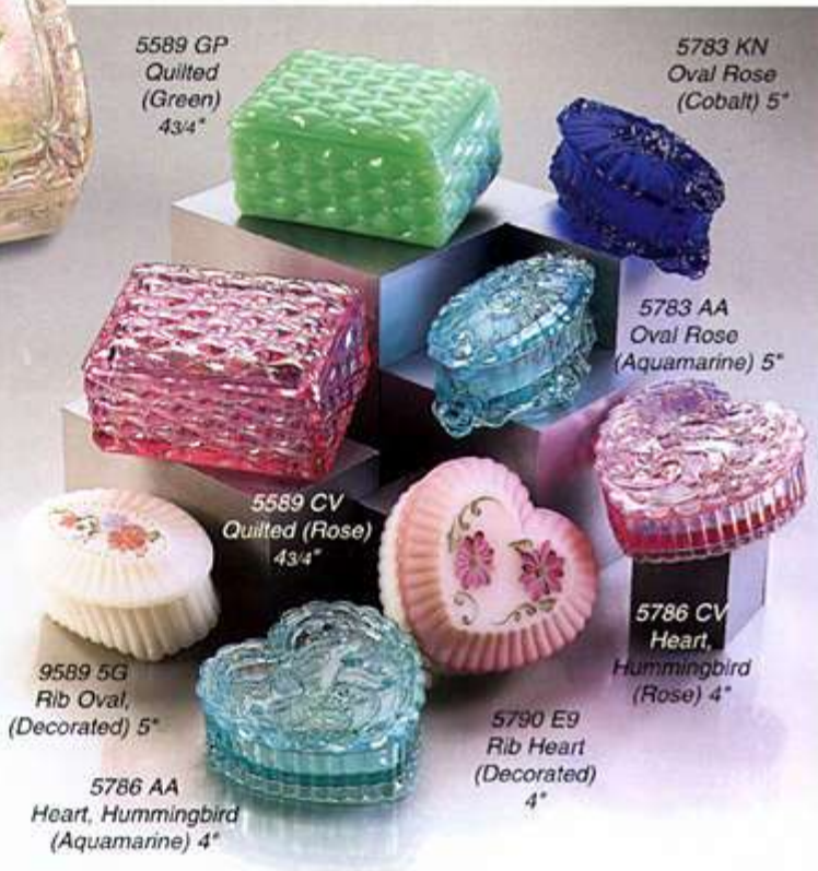
5589 GP Quilted (Green) 4 3/4"

0748 AS 12 Pc. Trinket Box Assortment (Includes one each of all trinkets, except two each on the 5783 KN, 5790 E9 and 9589 5G.)