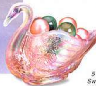
5127 PQ Swan, 5" w. (Champagne)

0749 AS 12 Pc. Swan Assortment (2 each of 6)