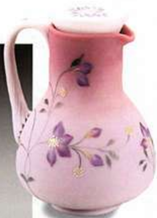
8100 UQ Guest Set, 7" (Limit: 1950)