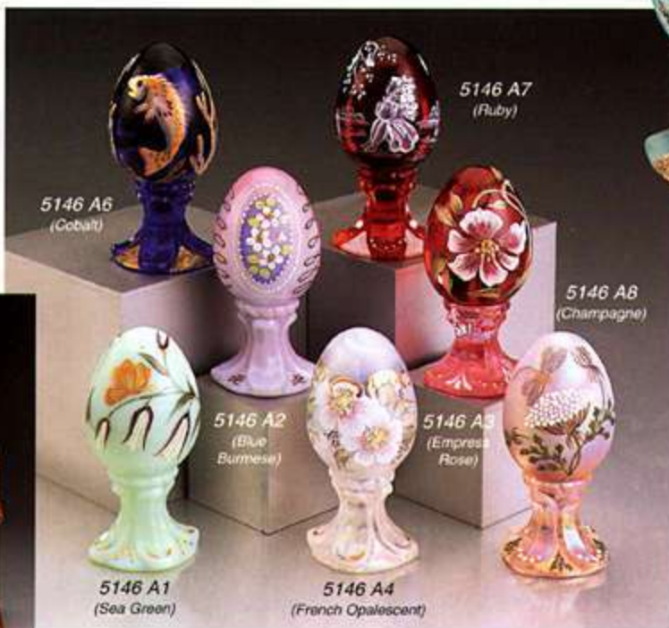
5146 A6 (Cobalt)

Save 3%! 0758 AS 17 Pc. Collectible Egg Assortment with Display Fixture