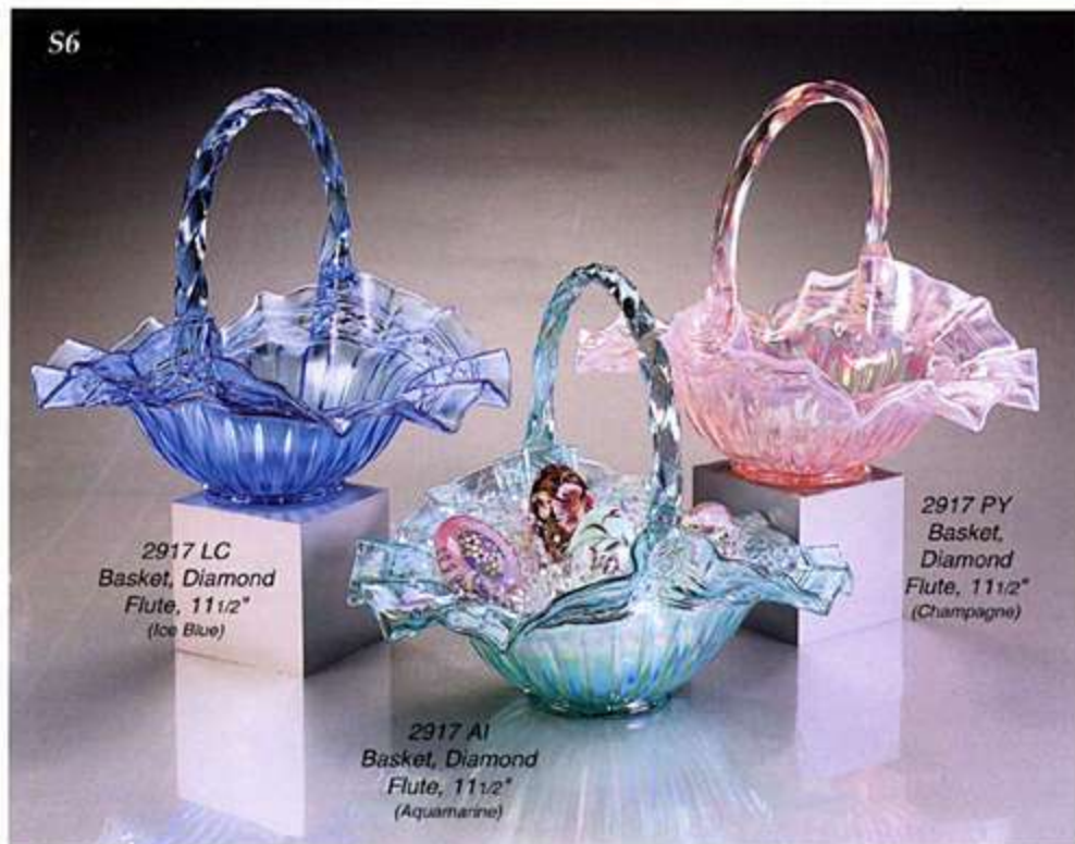
2917 LC Basket, Diamond Flute, 11 1/2" (Ice Blue)