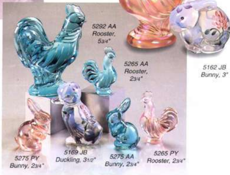
5292 AA Rooster, 5 3/4"

0755 AS 14 Pc. Animal Assortment (Includes two each of all small animals and 1 each of the large roosters)