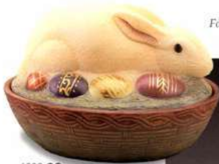
4683 CQ Bunny Box, 7"

Folk Art Animals Limited to Sales Through 3/31/99