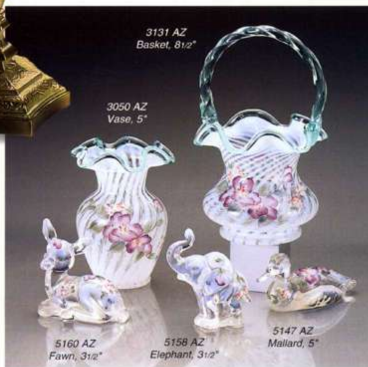
3131 AZ Basket, 8 1/2"