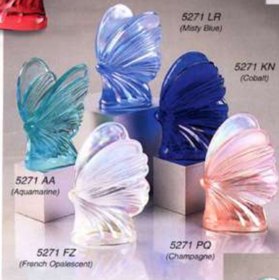
5271 LR (Misty Blue)