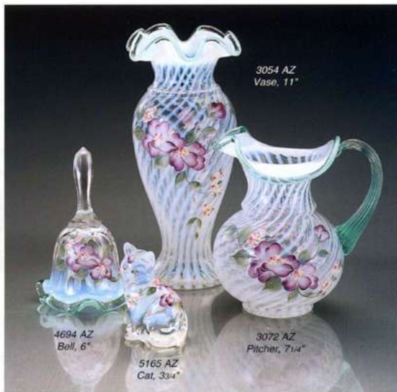
3054 AZ Vase, 11"