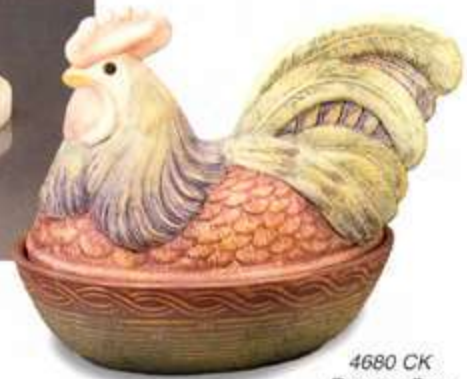
4680 CK Rooster Box, 8 1/2"

Colorful Folk Art animals - artistic decorative accessories for the home designed by Robin Spindler. Lined up on a mantel or sideboard, they make an impressive statement. Note the miniature rooster which is new for Spring 1999.