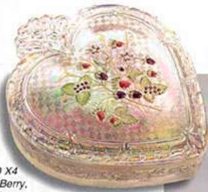
8200 X4 Heart, Berry, 7 1/2" w.