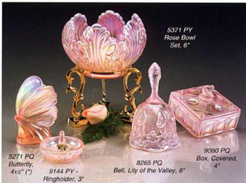
5271 PQ Butterfly, 4 1/2" (*)