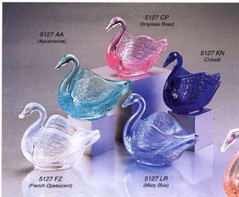
5127 AA (Aquamarine)