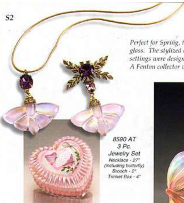
8590 AT 3 Pc. Jewelry Set Necklace - 27" (including butterfly) Brooch - 2" Trinket Box - 4"