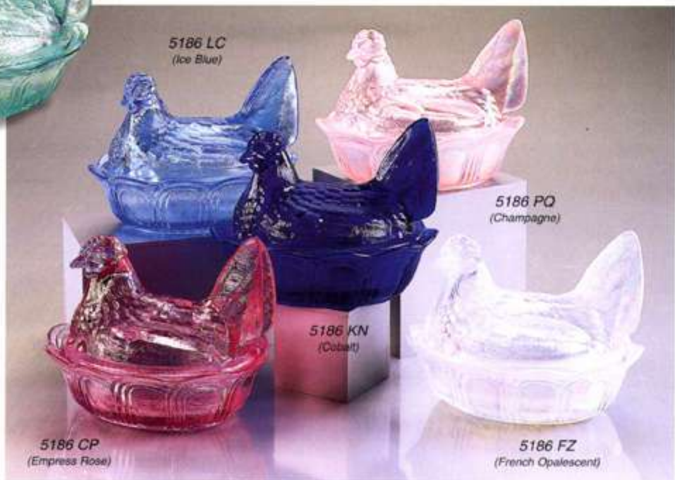
5186 LC (Ice Blue)

0751 AS 12 Pc. Hen on Nest Assortment (2 each of 6)