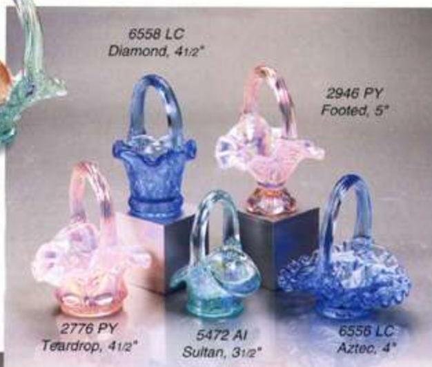
6558 LC Diamond, 4 1/2"