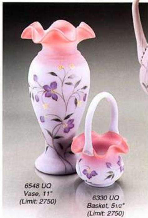
6548 UQ Vase, 11" (Limit: 2750)