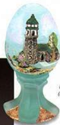
5146 A5 Egg, 3 3/4" (Aquamarine)

Individual works of art by four talented Fenton designers. Each egg is signed by the artist and numbered - only 3000 will be produced.