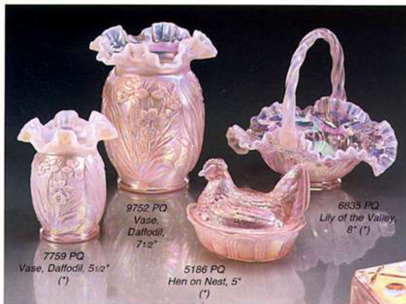
7759 PQ Vase, Daffodil, 5 1/2" (*)