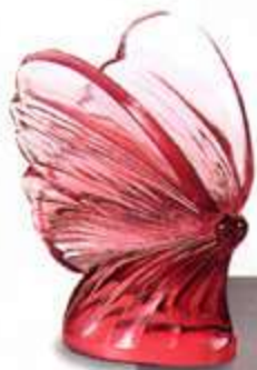
5271 CP Butterfly, 4 1/2" (Empress Rose)