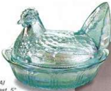
5186 AI Hen on Nest, 5" (Aquamarine)

Save 3%! 0750 AS 6 Pc. Folk Art Animals Assortment