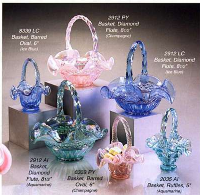
8339 LC Basket, Barred Oval, 6" (Ice Blue)