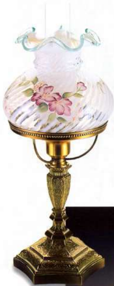
2791 AZ Lamp, Student, 18"

Save 3%! 0747 AS 19 Pc. Champagne Satin & Martha's Rose Assortment