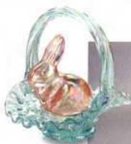
6556 AI Mini Basket, Aztec, 4"

0753 AS 12 Pc. Mini Basket Assortment (2 each of 6)