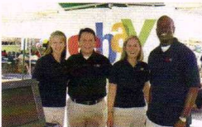
The eBay University team was on hand to assist folks with the promotion of their Fenton collections.