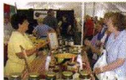
Artisans from WV's Tamarack participated in an Arts & Crafts Fair.