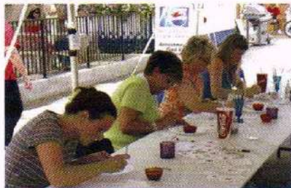
Visitors tried their hand at painting a glass ornament. Not an easy task!