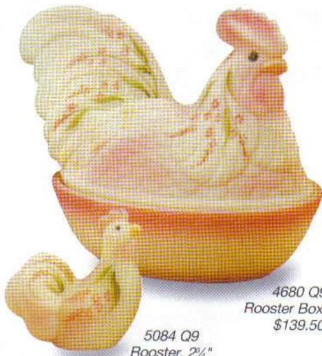
5084 Q9 Rooster, 2 1/4" $45.00

Robin Spindler's graceful "Coral Bells" design is a fitting tribute to the first-ever offer of our Rooster figurines in Burmese. Beautiful Burmese blushes from a creamy yellow to a peachy pink as a result of pure gold in the formula. Each piece is limited to sales through 6/15/06.