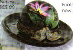
5385 XJ Hat w/stand, 4 1/2" (Black) $49.50