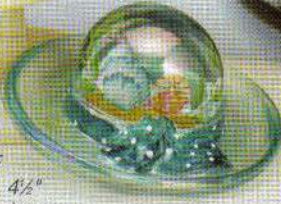
5385 XF Hat w/stand, 4 1/2" (Aquamarine) $49.50