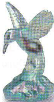
5066 4S Hummingbird, 4 1/2" $19.50

Kim Barley's "Sand Petals" design on luxurious stretch glass plays delicate florals against the velvety opalescence of Aquamarine Opalescent Stretch glass, and the result is breathtaking.