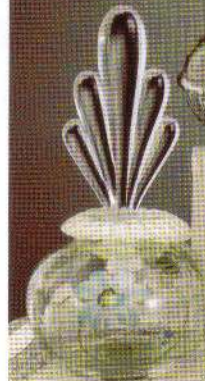
8103 VX Perfume, 6 1/2" $99.50