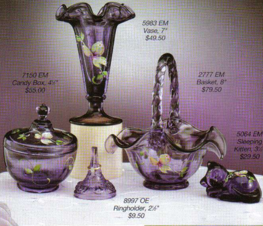
7150 EM Candy Box, 4 1/2" $55.00