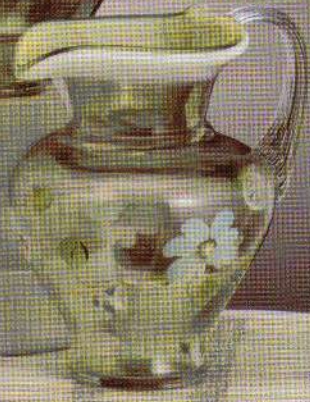
6142 VX Pitcher, 7" $109.50