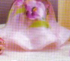
4694 BS Bell, 6", $55.00