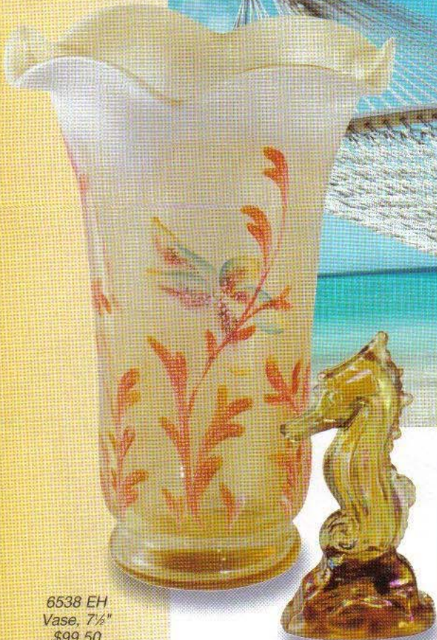
6538 EH Vase, 7 1/2" $99.50 (Christine Fenton)