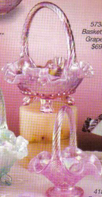
5738 NI Basket, Panel Grape, 7 1/4" $69.50