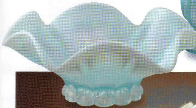
4332 9N Bowl, 10 1/2" $79.50

Frances Burton's delicate "Daisy Blue" design with melon berry accents trails across a field of pale gold Silken Sand, adding a simple touch of beauty to this entrancing new color.