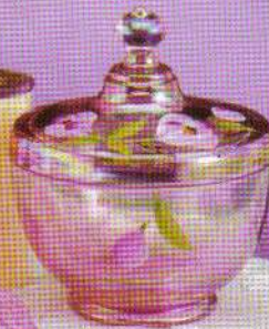
7150 BS Candy Box, 4 1/2" $59.50