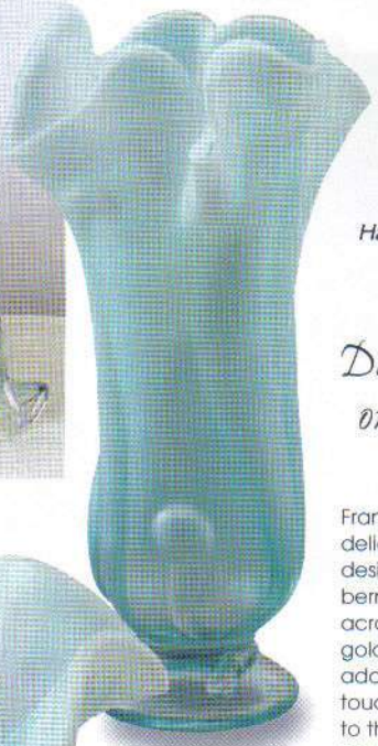
2753 9N Vase, Handkerchief, 10" $85.00