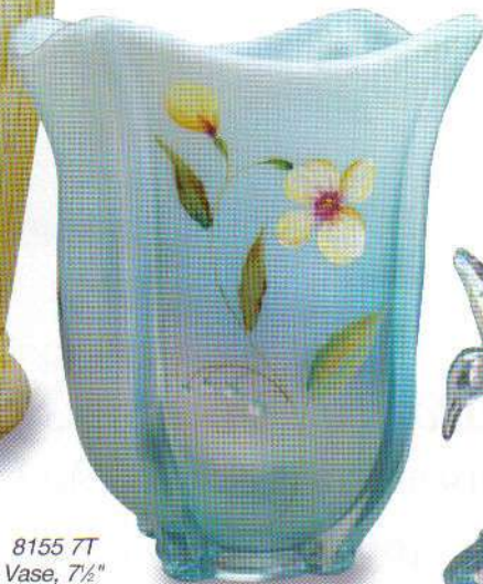
8155 7T Vase, 7 1/2" $119.50

Kim Barley's "Sand Petals" design on luxurious stretch glass plays delicate florals against the velvety opalescence of Aquamarine Opalescent Stretch glass, and the result is breathtaking.