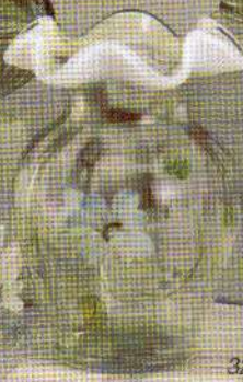
3214 VX Vase, 5" $75.00