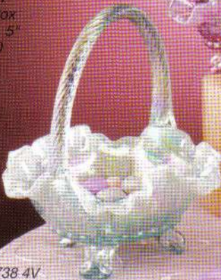
5738 4V Basket, Panel Grape, 7 1/4" $69.50