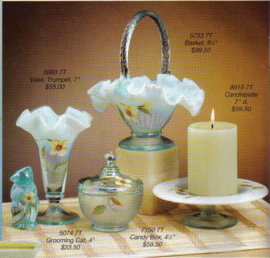
5983 7T Vase, Trumpet, 7" $55.00