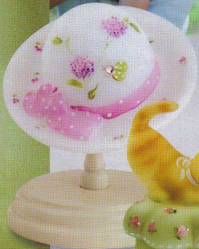
5385 ZY Hat w/stand 4 1/2" $49.50

Remembering shared treasures, sculptor Suzi Whitaker designed the new Treasure Box in the form of a playful cat perched upon an ottoman, ready to play. Cute yet functional, the cat's tail serves as ringholder while the ottoman stores tiny treasures.