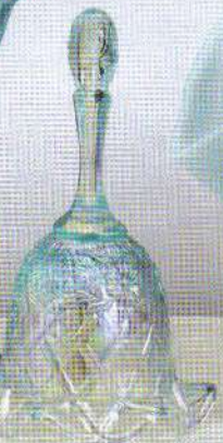
8362 4V Bell, 6 1/2" $36.50