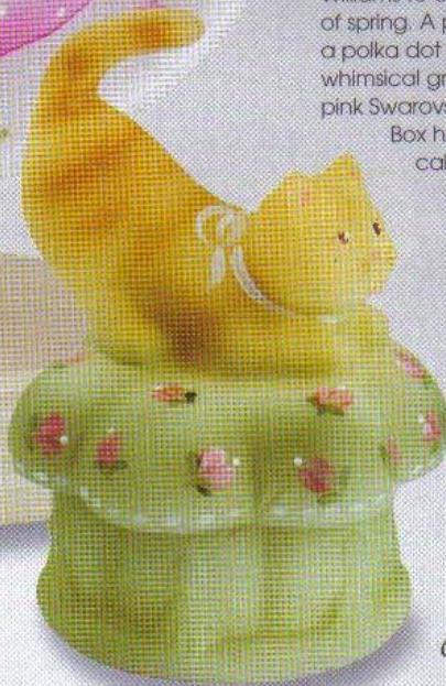
5361 VG Cat Ringholder Box, 4 1/2" $43.50