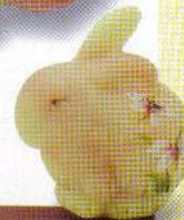
5162 HV Bunny, 3" (Burmese) $42.50

Classic shapes handcrafted by Fenton artisans for your spring decorating and entertaining. Each basket bears the mark of the handler.