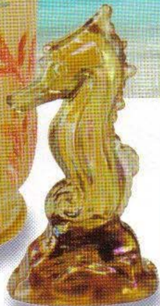
5354 AQ Seahorse, 4", $26.50 (Randy Fenton)