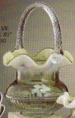
8133 VX Basket, 8 1/2" $99.50