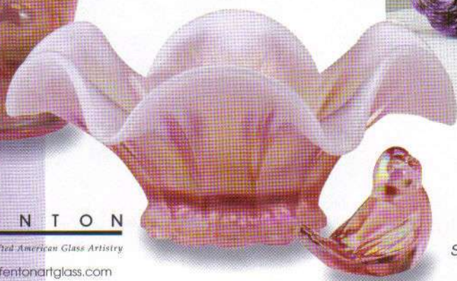
5363 NG Songbird, 3 1/4" w. $22.50