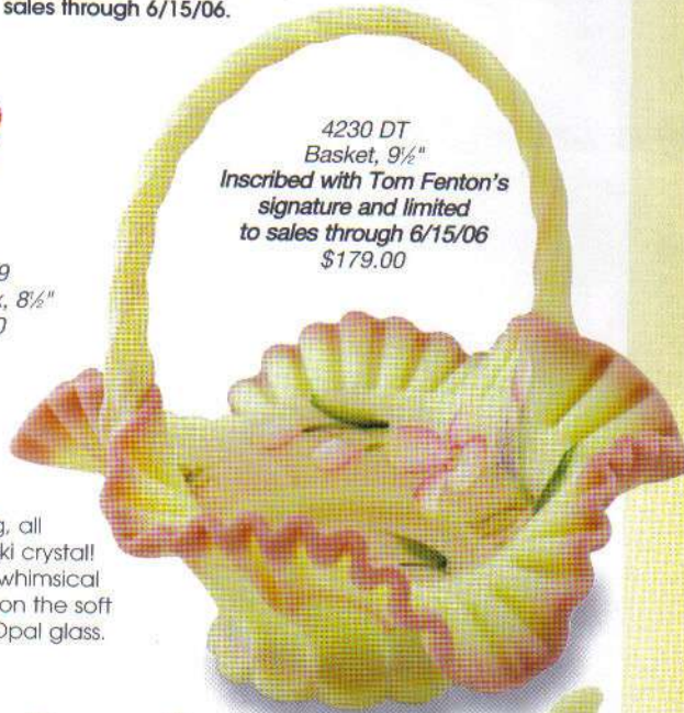
4230 DT Basket, 9 1/2" Inscribed with Tom Fenton's signature and limited to sales through 6/15/06 $179.00