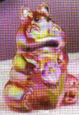
5063 BS Hippo, 3", $33.50