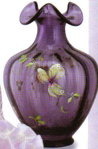
3289 EM Vase, 8 1/2" $109.50