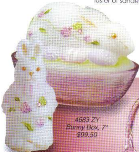
4683 ZY Bunny Box, 7" $99.50

A spectacular collection for spring decorating, all pretty in pink and punctuated with a Swarovski crystal! Stacy Williams' pastel floral design features a whimsical green polka dotted ladybug perched upon the soft luster of sanded Opal glass.