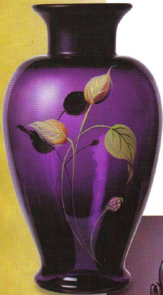
5955 JN Vase, 13"