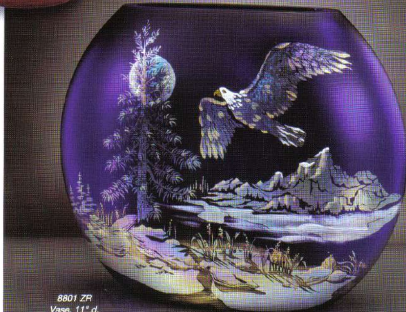
8801 ZR Vase, 11" d. (Limit: 950)

Inspired by our nation's powerful symbol of freedom and the towering mountains and firs of the Northwest, designer Robin Spindler created "Freedom Soars." The stately oval vase showcases the shimmering luster and matte sheen of Favrene glass as well as the artistic handpainted highlights of the eagle and surrounding habitat. With careful reheating during production, pure silver rises to the glass surface, bathing it in luster to create a unique color that is later sandcarved to reveal cobalt blue.