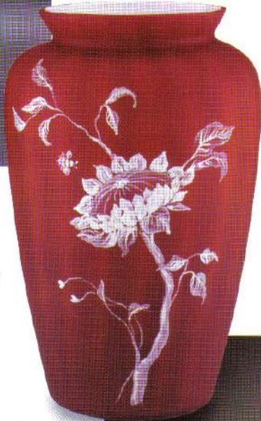
5437 YZ Vase, 8 1/2" (Limit: 1500)

The elusive Mulberry color returns in all its shaded beauty. A favorite canvas for Kim Barley, Mulberry emerges when a small amount of gold ruby glass is covered with azure blue and carefully blown, shading smoothly from magenta to blue. Each vase will vary, just as the changing colors of ripening mulberries. Kim designed a colorful wild anemone growing amidst 22k golden berries. A gold dragonfly with Swarovski stones swoops in to experience the heady aroma of a newly opened bud.