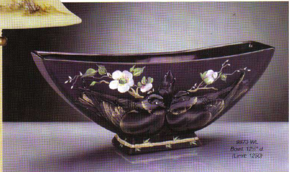
9873 WL Bowl, 12 1/2" d. (Limit: 1250)