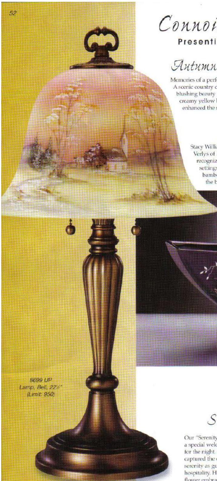
5699 UP Lamp, Bell, 22 1/2" (Limit: 950)