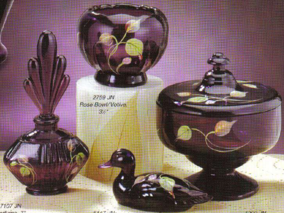
7107 JN Perfume, 7"