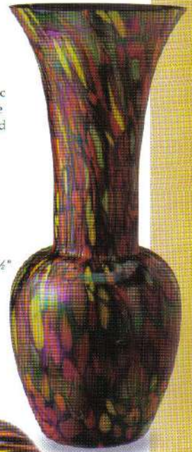
5456 1N Mosaic Vase, 8 1/2" (Limit: 1250)

A brand new shape continues the Mosaic art glass tradition begun at Fenton in the 1920s. The contemporary look is on trend for today's styles and is perfectly suited to the dramatic black glass layered with brightly colored chips. The glassmakers' artistry is heightened with the addition of thin threading strung randomly over the surface of the vase before it receives a mist of satin luster.