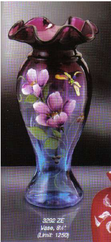
3292 ZE Vase, 8 1/4" (Limit: 1250)