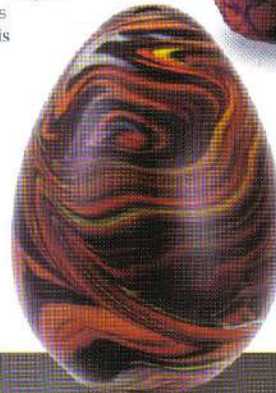
5031 7U Crayons Egg, 4 1/4" (Limit: 1250) Scott Fenton signature

Another creation from master glass artisan Dave Fetty complements his amazing Crayons vase. Made with several opaque "crayon" colors swirled through Black glass and covered with pure crystal, this artistic egg will make a stunning paperweight or table ornament. Seven colors—including brown, orange, yellow, two shades of green and two different reds—combine in ever changing blends to make this unique objet d'art for the home or office of discriminating collectors. Each egg is individually handblown and stamped with Dave Fetty's special logo.