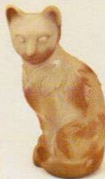
"Foliage" 5065 TR Limited to 500