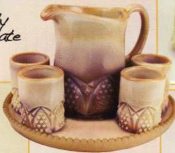
1951 CK Set of 2 Tumblers