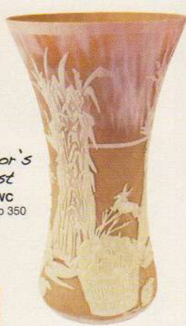
"McGregor's Harvest" 8559 WC Limited to 350