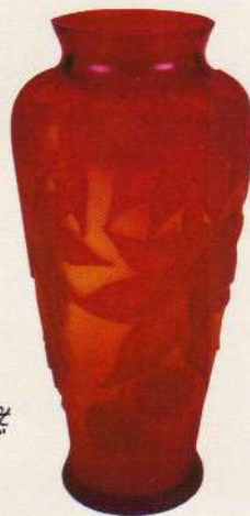
"Fall's Gift to Spring" 8812 XX Limited to 350