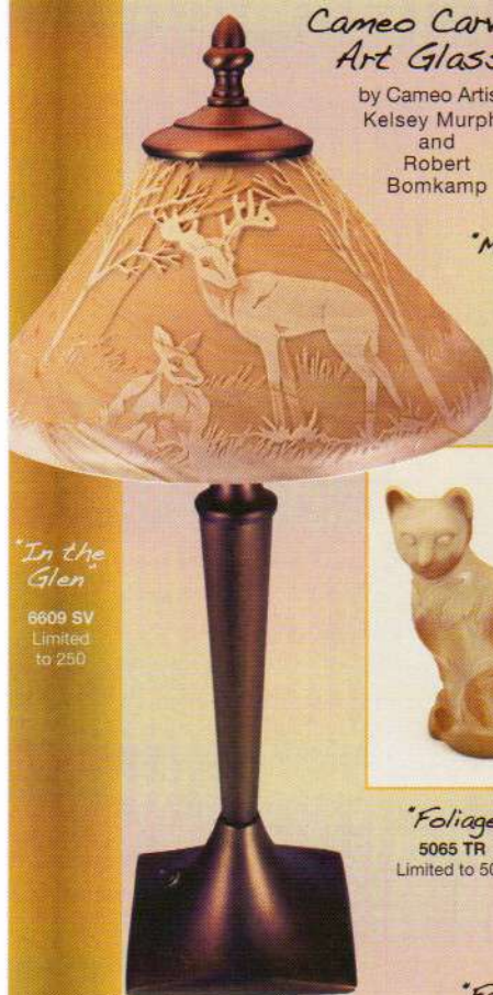
"In the Glen"