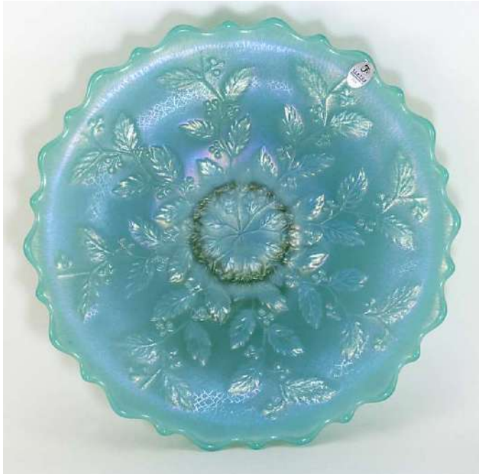
#C95539 Plate, Holly, 9 1/2".

1999, QVC, single item, holly plate (looks like Aqua Opalescent on the surface!).