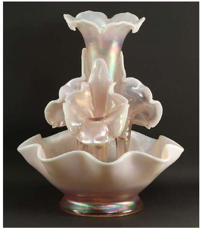
#C7505 PQ Epergne, 5-piece.

Misty Blue Satin (LR) 1997-99, usually satiny, but some with stretch.