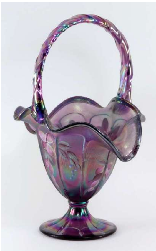
#C53688 Basket, panels. lily crimp.