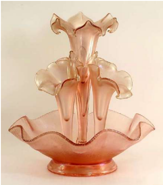
#7405 VR Epergne, 5-piece, 13", 1980 75 th

Velva Rose (VR) made in 1980 with "75 th " on bases, then in general line for 1981-82