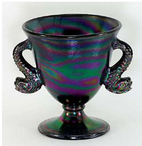
Black Stretch 1997 SGS club piece and whimsys.