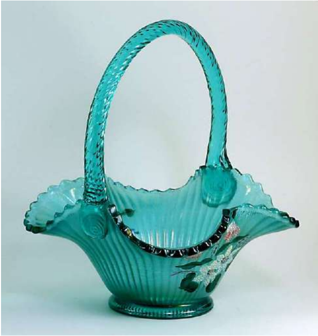
#2787 ST Basket, signature of Bill Fenton.

Stiegel Green Stretch (SS) 1994 Historic Collection (ST = with floral decoration)