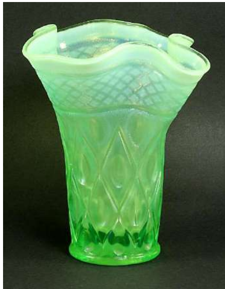
Key Lime Opalescent Stretch (??) 2010.