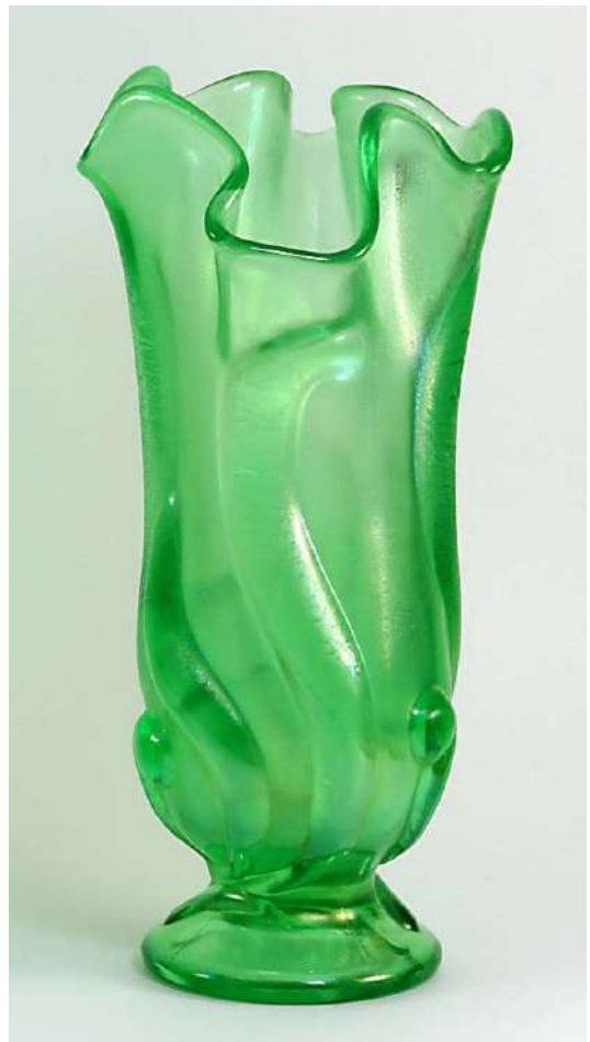
#2753 JP Vase, handkerchief, 11”h (=stylized).