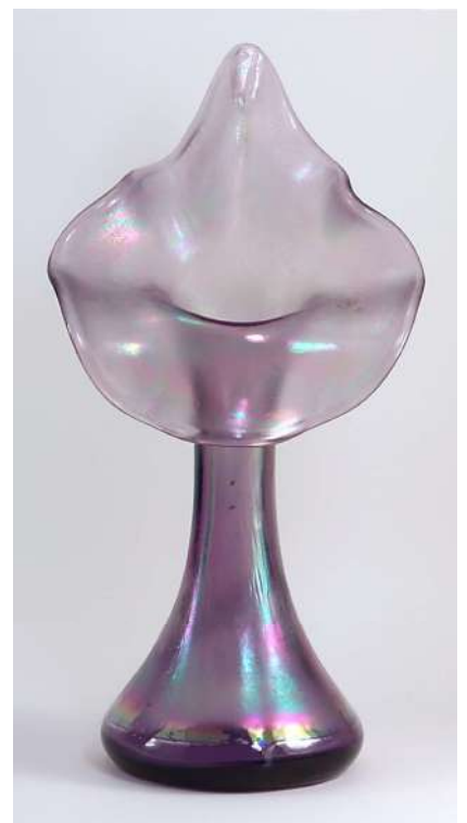
#7255 XK Vase, JIP top, 9" h.

1999, (XP when carnival; KP when decorated).