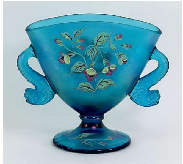
#C13803 Fan Vase with floral decoration.

Dusty Rose Stretch 1994 QVC bowl and candleholders (has more blue than Velva Rose)