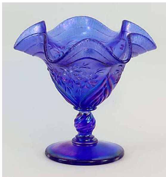
#C23155 QD Nut Dish, Flowers, 2003 Museum collection.