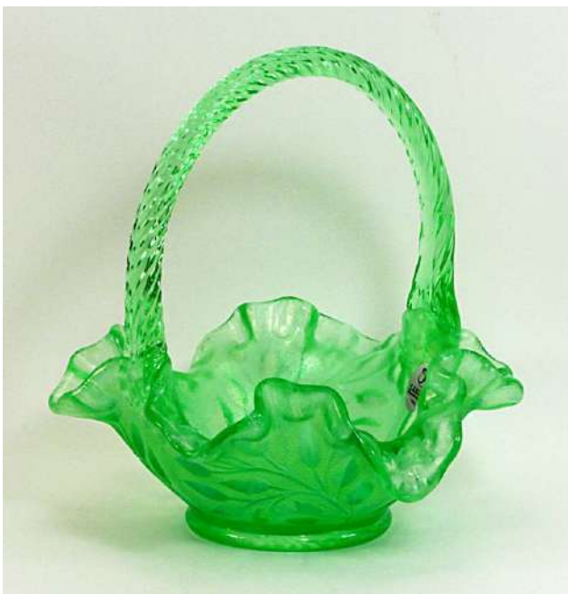
#2853 JP Basket, Wildflower, 7”h.

Green Apple Stretch (JP) 2004, JH or JD = non-stretch, shiny items; JQ = Pansy Morning decoration.