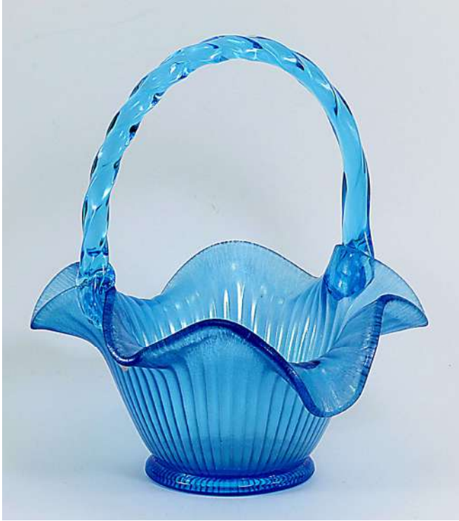
#5430 KA Basket, 8”h (fine rib, lily edge).

Celeste Blue Stretch (KA) 2004 line, (KJ or K4 when not reshaped; KP="Dancing Daisies" by Stacy Williams).