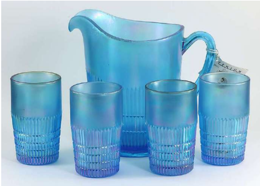
#9001 KA Water Set, Lincoln Inn, 5-piece.