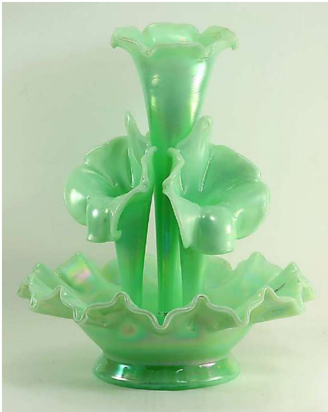
#7601 GE Epergne, 5-piece.

Sea Green Satin (GE) 1998, usually satiny, but some with stretch.