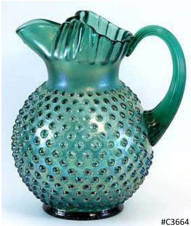
#C3664 SJ Pitcher, hobnail, ice lip.