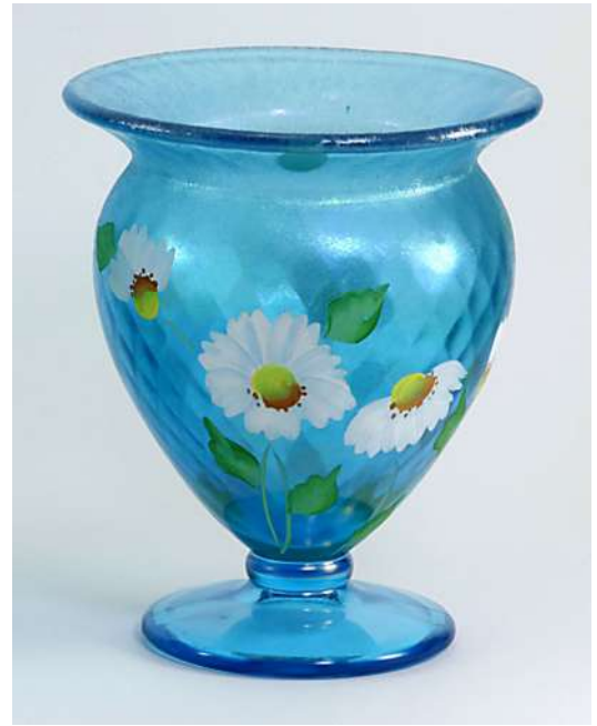
#1168 KP Vase, Footed, (diamond-optic, pinched flared).

Green Apple Stretch (JP) 2004, JH or JD = non-stretch, shiny items; JQ = Pansy Morning decoration.