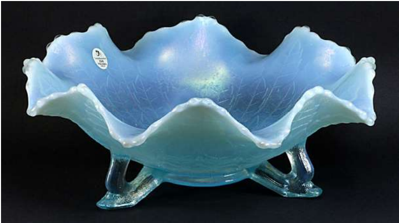
#4529 9N Bowl, Leaf-tiers, 10".