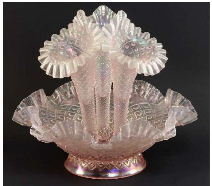
#4801 SW Epergne, Diamond-lace, 4-piece.