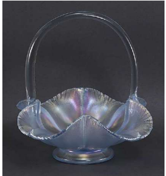
#7536 VB Basket, 8" (melon-rib square)

Velva Blue (VB) in general line for 1981-82