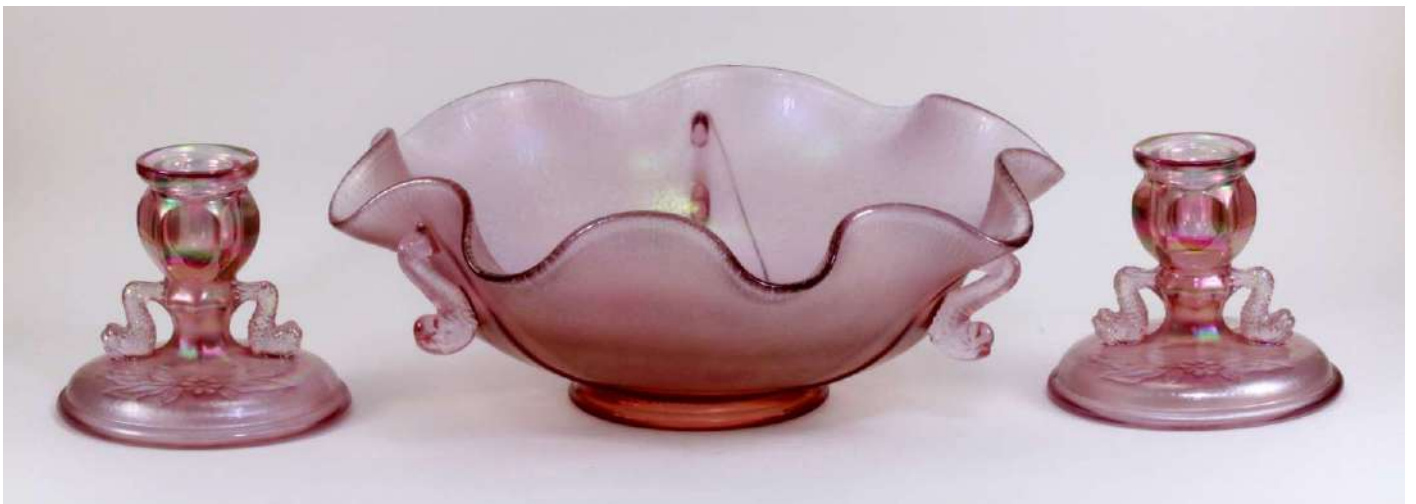
#C13363 Bowl, 3-dolphin, 6-crimp & C13364 Candleholders, 2-dolphin.

Dusty Rose Stretch 1994 QVC bowl and candleholders (has more blue than Velva Rose)