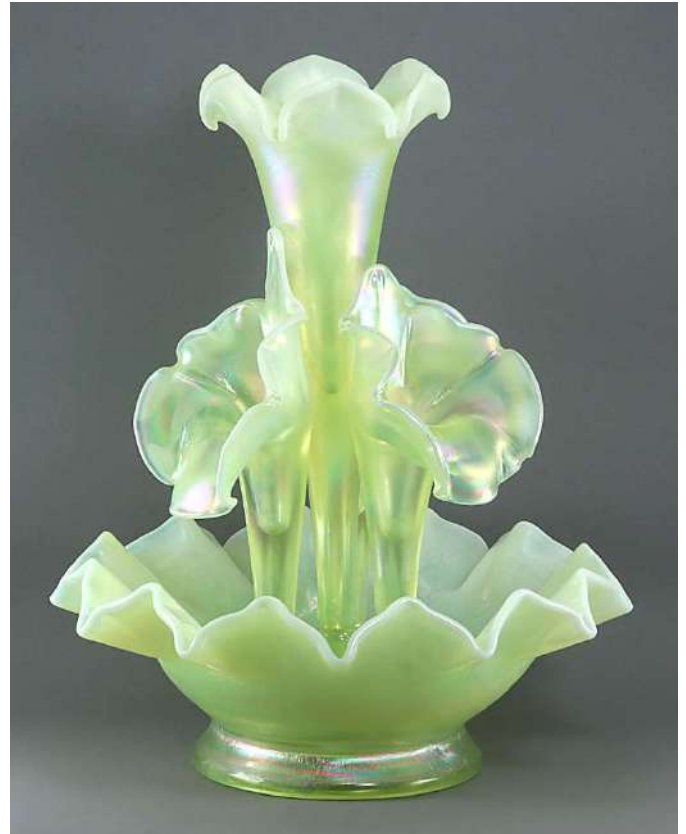
#7601 TS Epergne, 5-piece.

Topaz Opalescent Satin (TS) 1997, usually satiny, but some with stretch.