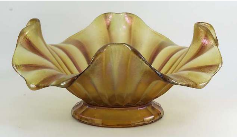
#5987 AQ Bowl, Ribbed, 12" (square crimped).