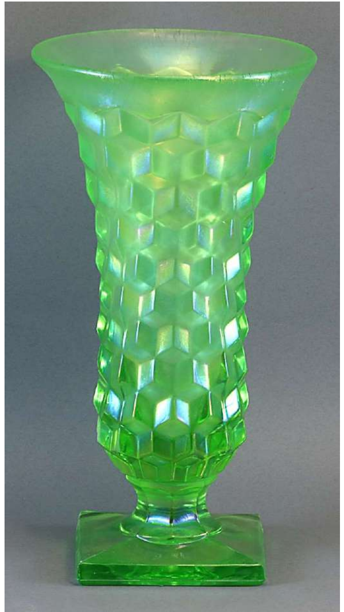
#4380 HF Vase, American, 10".