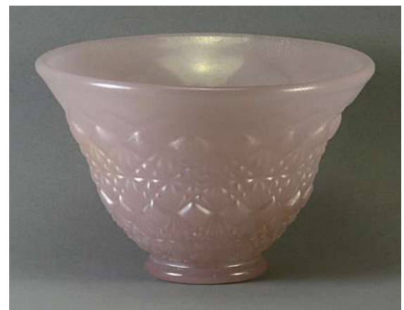
Translucent Pink Stretch experimental item from Fenton Shop, late 1990s.