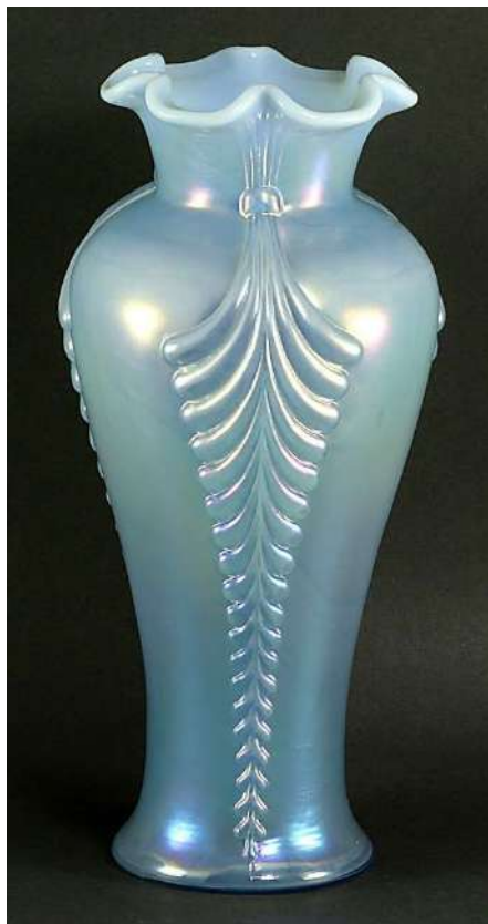
#2782 LR Vase, plume, 11"h.

Misty Blue Satin (LR) 1997-99, usually satiny, but some with stretch.