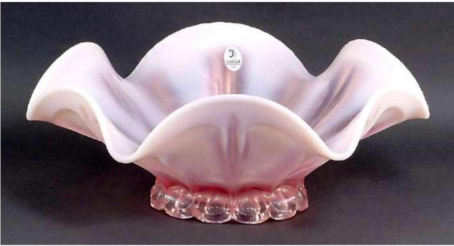
Rosemilk Opalescent Stretch (NZ) 2004-06, NI = non-stretch, shiny iridescence; BS = Tulip Delight decoration.