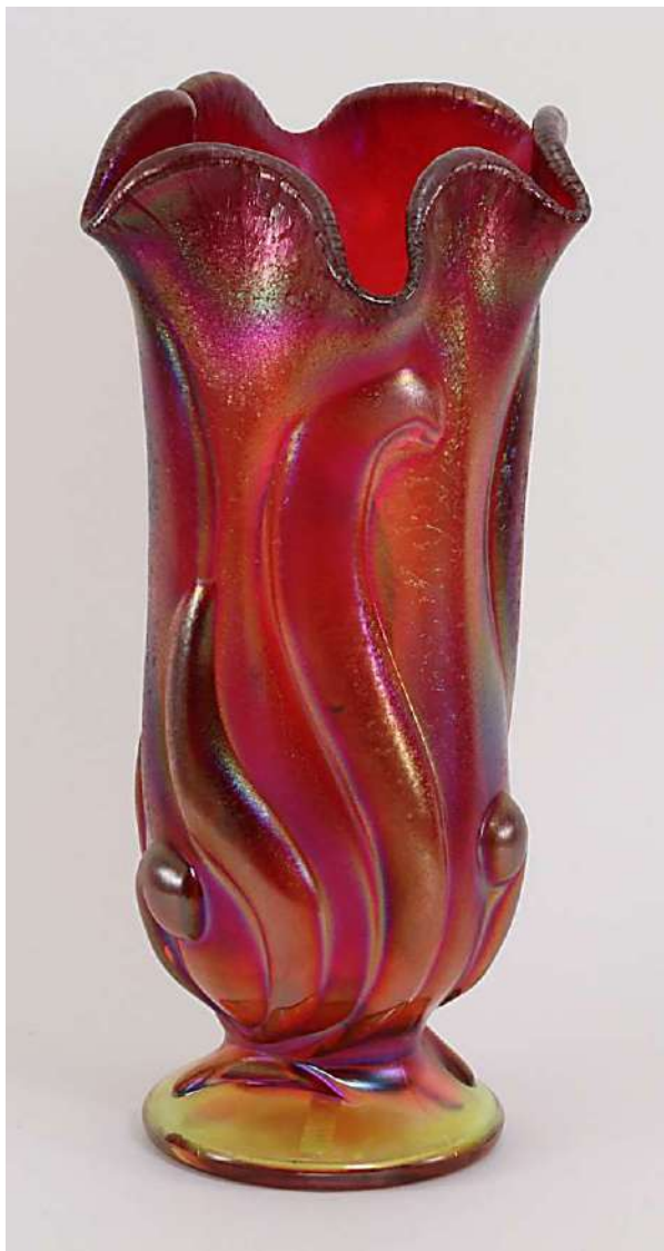
#2753 RL Vase, handkerchief, 10”h (=stylized).

Ruby Amberina (RL) 2003-07, UR = not reshaped shiny to satiny items; U8 = Wine Country decoration; TR = Trailing Wisteria decoration; QY = Tuscan Charm decoration; AF = Golden Pods decoration.