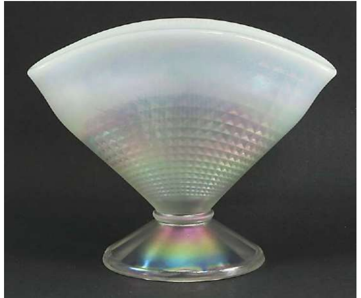
#1136 Vase, fan, diamond optic, 6" wide.

1998, single item, fan vase. (R5=with roses decoration.)