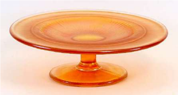
#8919 5J Candleplate, 7".