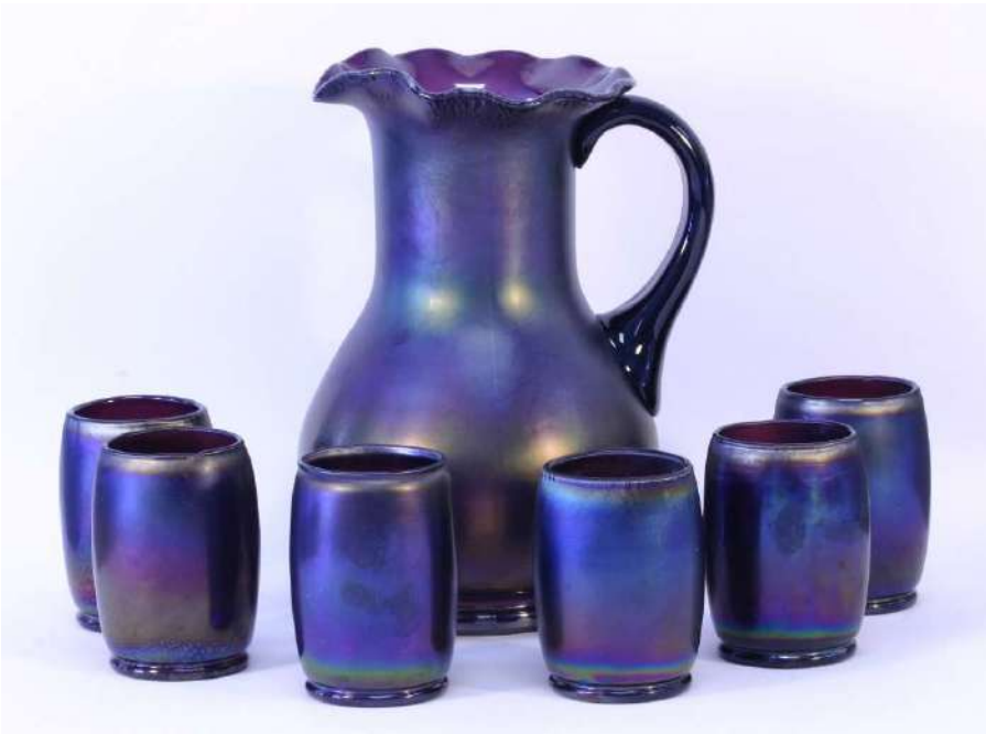
#7509 VY Water Set, tankard & tumblers, 7-piece set (tumblers were either fire polished or ground tops)