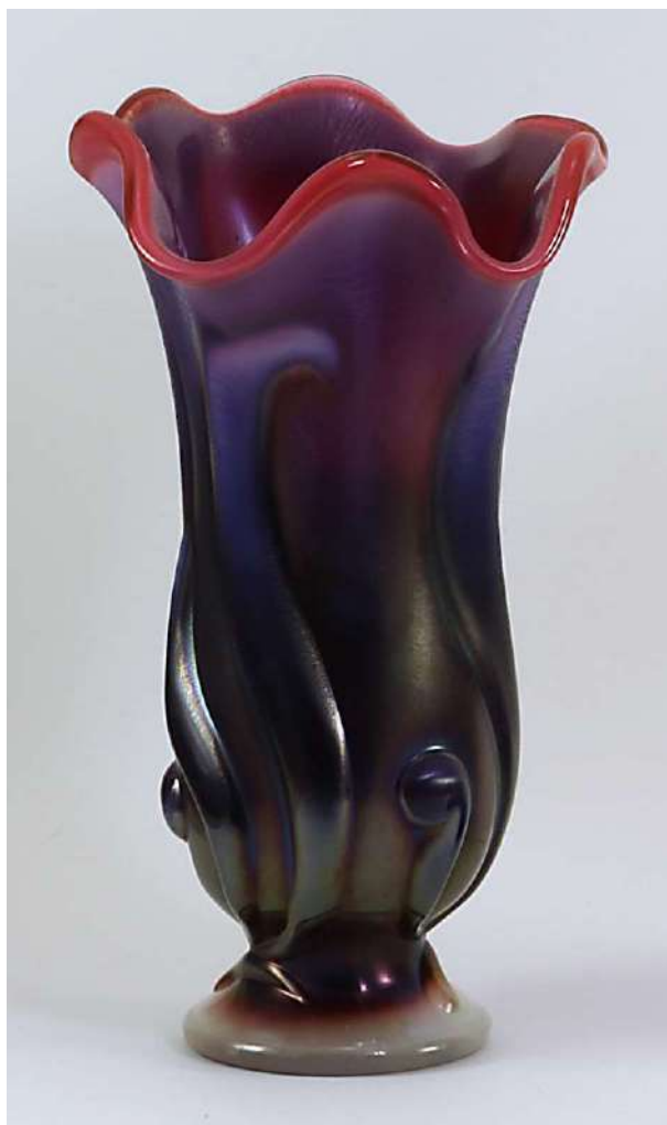
#C5137 Vase, handkerchief, 10”h.