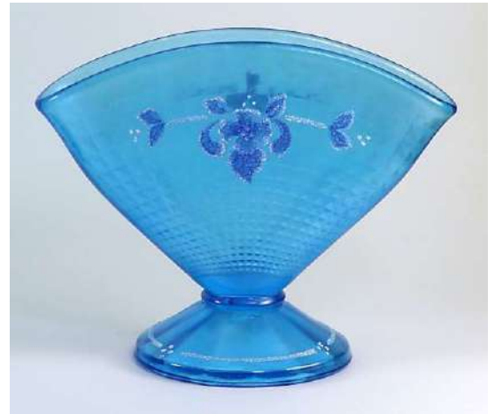
#1136 JE Vase, Fan, 6" with coralene.