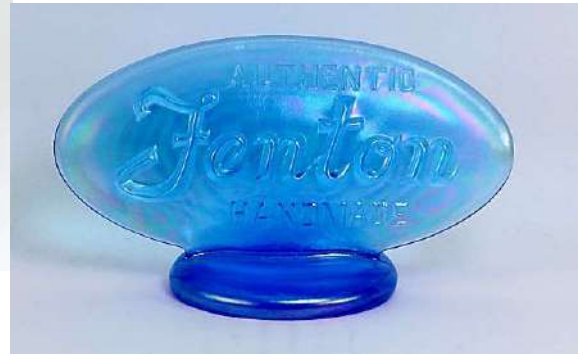
#9499 KA Logo, oval, 5" wide.