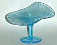
Fenton Jack-in-the- -pulpit (JIP) Comport