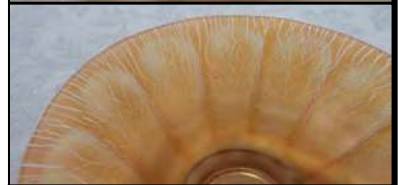
Imperial Rose Ice bowl

From eBay came this Fenton Topaz decorated covered jar. It is very nice and a shape only made in the Late Period.