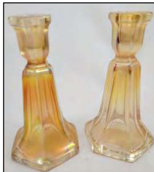
Imperial Marigold candleholders