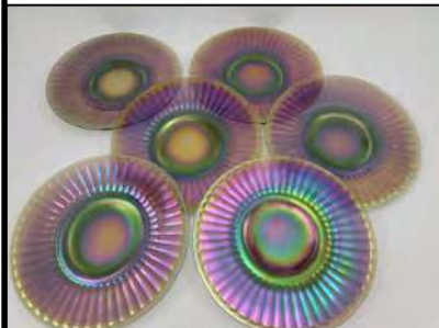
Imperial narrow panel Blue Ice plates

I hope you have been finding some stretch glass which you will share with us in the next Quarterly.