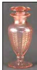
Fenton Quilted Diamond