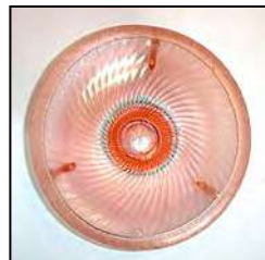
Fenton Swirl Optic