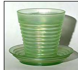
Fenton Florentine Green