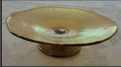
US Glass amber 'card tray'

This time of year is always a fun time for 'finding' stretch glass because Burns Auction Service brings a truckload of stretch glass to our convention. Hopefully, you 'found' some stretch glass in our convention auction - I certainly did. I've also been finding some stretch glass in the wild, if you count eBay as 'the wild.' It is certainly not as wild as running around Brimfield at 5am with a flashlight, but we can only do that 3 times a year. The rest of the time, eBay does provide access to some nice stretch glass from time to time.