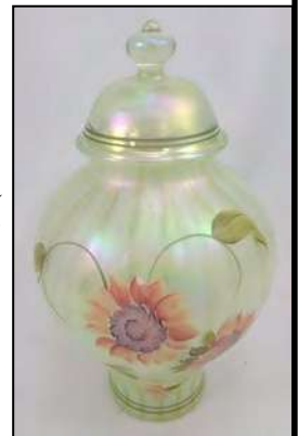
Fenton Topaz covered jar