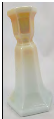
Imperial Marigold over Milk Glass candleholder