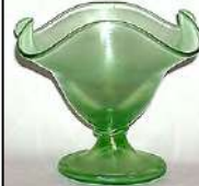
Fenton #9 Square Comport