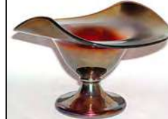
Fenton #9 Oval Comport