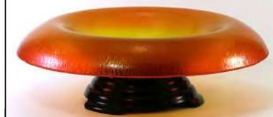
Fenton Special Rolled Rim Bowl