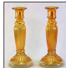
Diamond Adam's Rib