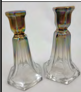
Imperial Blue Ice candleholders