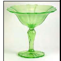
US Glass Green

If further work is needed to identify your stretch glass, the next step is to look for a design created by the mold. If your piece of stretch glass has a molded pattern, this will quickly establish the company by which it was made. Patterns or designs are either optic, that is viewed through the glass or pressed, on the outside of the glass. Fenton had Diamond Optic, Quilted Diamond (the very small diamond optic design found on fan vases, colognes, powder puffs and candy jars) and swirl plungers to create optic designs on the inside of some of their stretch glass. Diamond made Adam's Rib, a pressed pattern which is on the outside of the items, Imperial made Chesterfield, Wide or Smooth panels and Floral & Optic. Northwood made 'Expanded Diamond.' In addition, Lancaster and US Glass painted some of their stretch glass.