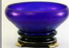
Diamond Cupped Bowl