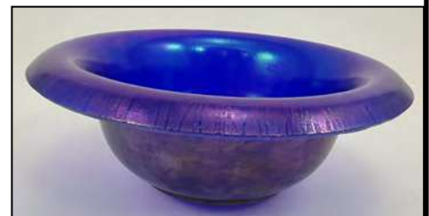
Fenton Royal Blue bowl