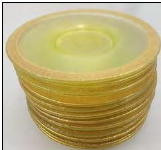
Northwood topaz plates