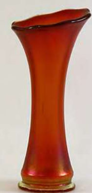
Imperial Swung Vase

We also discussed the difference between a sample, a one-of-a-kind known, a whimsey, a souvenir and an only one known (at this time). We reviewed the nine companies which made stretch glass, the colors and shapes that were unique to each of them and the company marks which can be found in the glass.