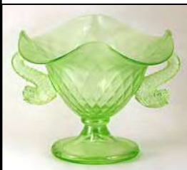
Fenton Diamond Optic

If further work is needed to identify your stretch glass, the next step is to look for a design created by the mold. If your piece of stretch glass has a molded pattern, this will quickly establish the company by which it was made. Patterns or designs are either optic, that is viewed through the glass or pressed, on the outside of the glass. Fenton had Diamond Optic, Quilted Diamond (the very small diamond optic design found on fan vases, colognes, powder puffs and candy jars) and swirl plungers to create optic designs on the inside of some of their stretch glass. Diamond made Adam's Rib, a pressed pattern which is on the outside of the items, Imperial made Chesterfield, Wide or Smooth panels and Floral & Optic. Northwood made 'Expanded Diamond.' In addition, Lancaster and US Glass painted some of their stretch glass.