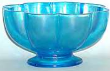
Fenton Melon Rib Normal Bowl