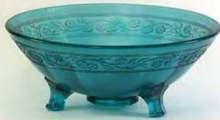
Imperial Floral & Optic Flared Bowl