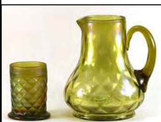
Northwood Expanded Diamond

We also discussed the numerous unique shapes made by the various stretch glass companies and agreed that identification of the maker of a particular piece of stretch glass is not always as difficult as it seems. As always, paying special attention to the dimensions of the item in question is key.