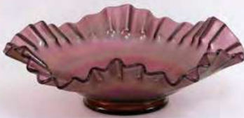
Fenton Double Crimped Bowl