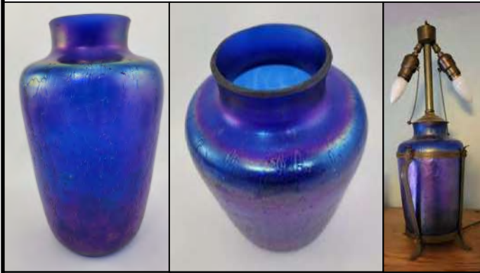
Diamond cobalt Crackle

I may be one of only a few stretch glass collectors who buys plates. I find them very beautiful and useful. Here is a set of Imperial narrow panel Blue Ice plates which will brighten up our table. From the same dealer I bought this set of 12 Northwood topaz plates with gold trim. They are in amazingly mint condition.